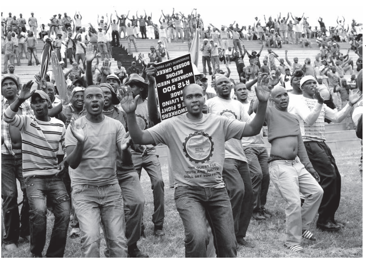
South African platinum miners of the AMCU at January 19 rally in Rustenburg voted to strike. The walkout, the largest and longest in South Afircan history, is now in its sixth month.

With consummate cynicism, the ANC election manifesto announces the "first phase" of the "democratic transition" has been completed. Their mentors are the SACP, the high priests of the Menshevik-Stalinist theory of stages who excuse every crime with the mirage of ultimate "socialism." According to the ANC, "our people's dignity has been restored" in this first phase. Tell it to the Marikana miners, or the township residents gunned down by the police as they demand clean drinking water and housing! In mid-March, police and ANC officials shot at protesting schoolchildren at Bekkersdal in the Gauteng province around Johannesburg. Even The Citizen (a tabloid oriented to the black middle class) compared