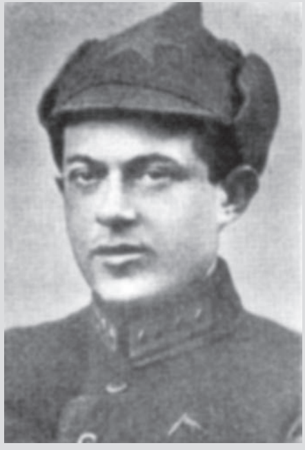
Ukrainian Jewish Red Army general Iona Yakir

zigzags led from a policy of enriching the kulaks to forced collectivization of agriculture centered on the Ukraine, traditionally the breadbasket of Russia, leaving over 3 million dead in the ensuing famine. Then in World War II, Stalin resorted to forced transfers of almost 200,000 Crimean Tatars to Central Asia on charges of collaborating with the Nazi invaders. After the war, Poles in western Ukraine were pushed out to resettle in lands to the west seized from Germans, who were likewise expelled en masse. Meanwhile, the Banderaite terrorists of the UPA joined the Nazi SS in massacring Jews and later carried out pogroms against Poles as part of a drive for an ethnically homogenous Ukraine. These forcible population transfers followed the deadly logic of nationalism, which we see again today.