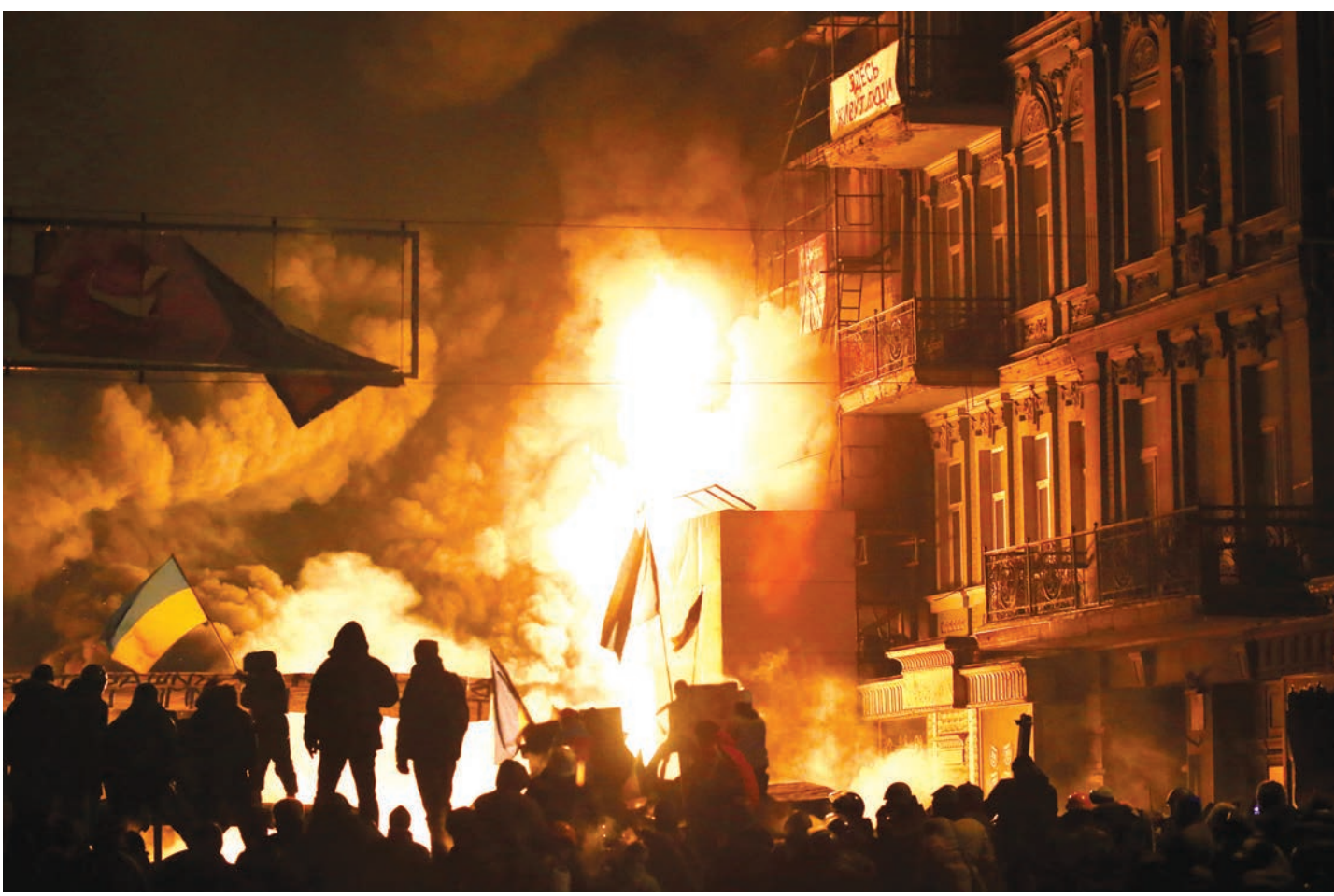
As tottering Yanukovitch agreed to concessions on January 25, fascist squads in Maidan escalated action (above).

The talk in the media of a new Cold War underscores that the standoff over Ukraine is a byproduct of the destruction of the Soviet Union, a bureaucratically degenerated workers state. The 1991-92 counterrevolution led to impoverishment of the population in the post-Soviet states as capitalism devastated whole industries, women lost rights and interethnic hostilities were stoked. The 1917 Bolshevik Revolution led by Lenin and Trotsky brought down the Russian Empire of the tsars, a notorious "prison house of peoples," by uniting the working people of different nationalities. In Ukraine, long enslaved by the Russian and Austro-Hungarian empires, the Bolsheviks achieved victory in a multi-sided civil war by uniting the struggle for social revolution with national liberation. As commander of