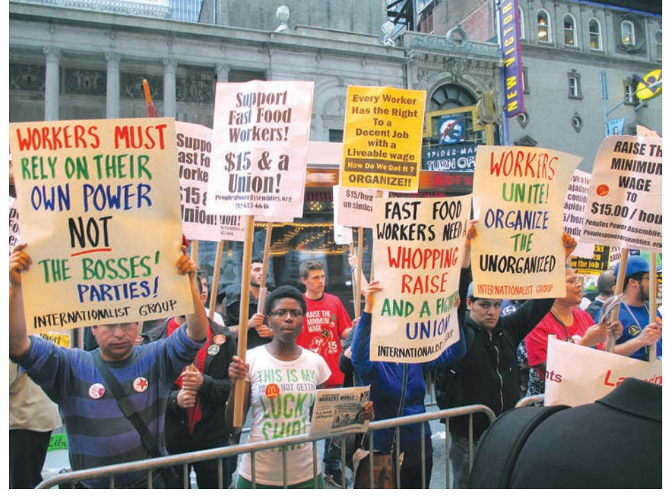
Protesta contra los bajos salarios frente a un restaurante McDonald's cerca de Times Square, Nueva York, el 15 de mayo.