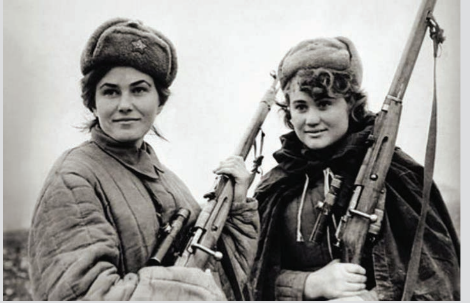
While Ukrainian nationalists glorify Nazi collaborator Bandera, we hail Ukrainian Soviet partisans who joined with Red Army in defeating the fascist scum. Shown here are members of the Sydir Kovpak partisan detachment.

Svoboda, Pravy Sektor and the other fascist and ultra-nationalist groups that have played a leading role in the Maidan protests are not a uniquely Ukrainian phenomenon. Significant fascist movements have appeared in different parts of Europe in the wake of counterrevolution in the USSR and former Soviet bloc, and particularly in recent years as a reflection of the capitalist economic crisis that exploded in 2008 and continuing mass unemployment. This has become a mass movement in countries where the bourgeoisie has whipped up hatred of immigrants and national minorities, such as Jobbik in Hungary, the National Front in France and Golden Dawn in Greece. Appeals for ethnic purity are an essential ingredient in this hysteria, along with the usual anticommunism of fascist movements, which