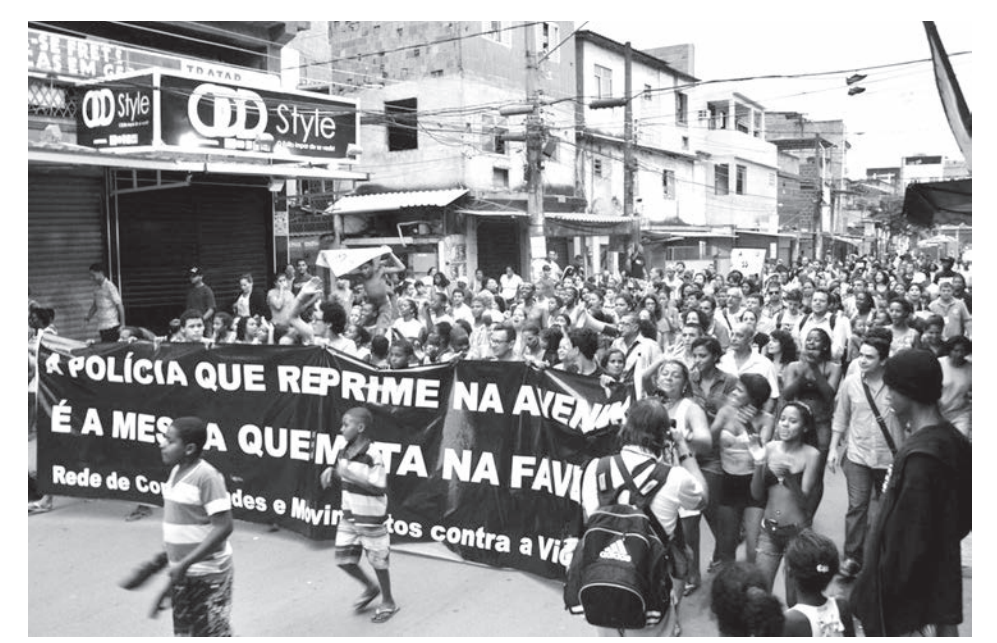
"The Police Who Repress in the Streets Are the Same Ones Who Kill in the Favelas." March protesting killer cops in the Maré Complex, June 2013.

Christ the Redeemer<sup>3</sup> insists on keeping the descendents of the slaves under its whip. For it, the phrase in the Communist Manifesto that the proletariat will be the gravediggers of the bourgeoisie is a constant nightmare, since the potential gravediggers live right above them and all they would have to do is come down from the hills, from the favela of Rocinha to Leblon, from Cidade de Deus (City of God) to Tijuca, etc.