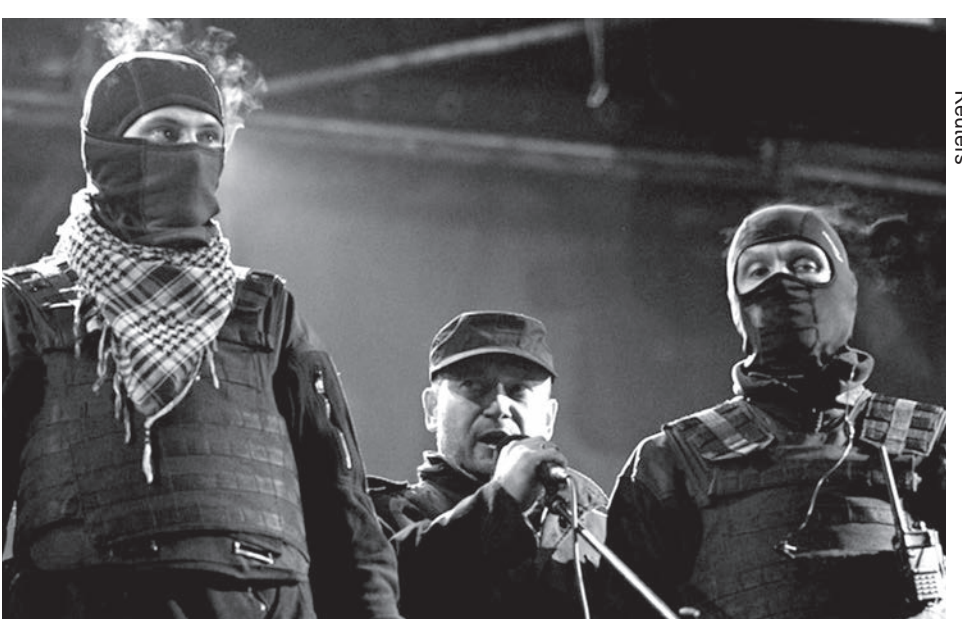
Dmytro Yarosh, leader of the neo-Nazi Pravy Sektor (Right Sector) storm troops, speaking at the Maidan, February 21. This fascist coup leader, now deputy defense minister of Ukraine, is planning a paramilitary National Guard.