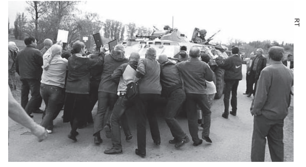
Unarmed civilians block National Guard armored personnel carrier in Kramatorsk, May 2. Government forces killed 10.