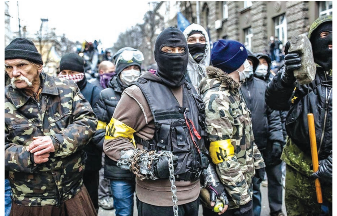
Fascist thugs of Svoboda with swastika-like "wolf hook" arm bands during riots in Kiev, February 6.

Putin's decisive takeover of Crimea without firing a shot has put the coup regime in Kiev in a bind, lacking the means to challenge it. It also won broad support in eastern Ukraine, with tens of thousands joining pro-Russian demonstrations in the industrial centers of Kharkiv, Donetsk and Luhansk. The Western imperialists so far have come up with nothing more than U.S. visa denials and pulling out of a Group of Eight (G8) summit scheduled for the Russian Black Sea resort of Sochi in June. Berlin would be hard put to do without energy supplies from Russia, which provides much of the natural gas that fuels German industry. But even we are seeing "all the if Putin's aims are limited, particularly to protect the strategically located home port of ing the growth of violent Russia's Black Sea fleet, imperialist ultimatums and provocative actions by Ukrainian ments. And as always, nationalist and fascist bands could spark a