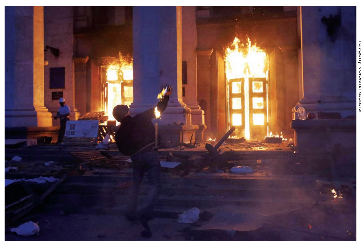
Fascist attacker throwing gasoline bomb at trade-union headquarters in Kiev, Ukraine, May 2. At least 48 died in the massacre and over 200 were injured.

This was a well-planned operation, and not just by some ultra-rightist street gangs but by the Kiev junta in which fascists control the key "power ministries" – interior, police, military – and by oligarchs acting as regional warlords with their own private armies. The pretext was a soccer game between the