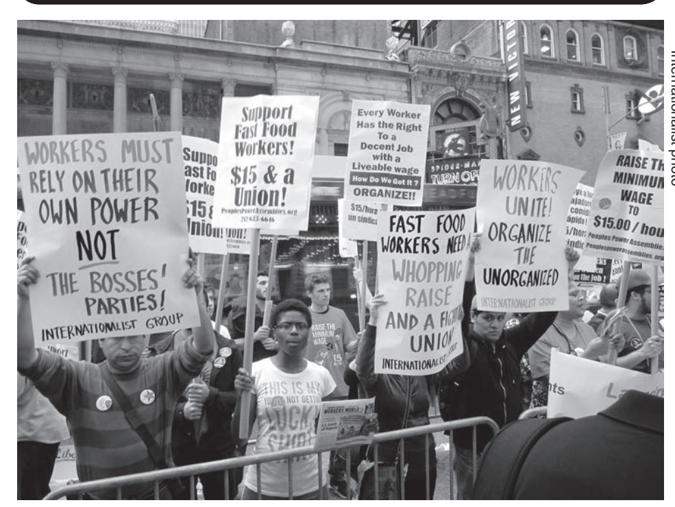
Demonstration outside McDonald's restaurant near Times Square, New York City, during May 15 fast food workers "strike."

Yet the various campaigns (15 Now, Fight for 15. Fast Food Forward, etc.) all focus on pressuring the Democrats. Even when led by ostensible socialists, they are basically electoral gimmicks. The "strikes" that have been called are purely symbolic: very few low-wage workers actually join in for a simple reason - without union protection they run a huge risk of being fired. To counter that what's needed isn't appeals to "elected officials" but to mobilize union