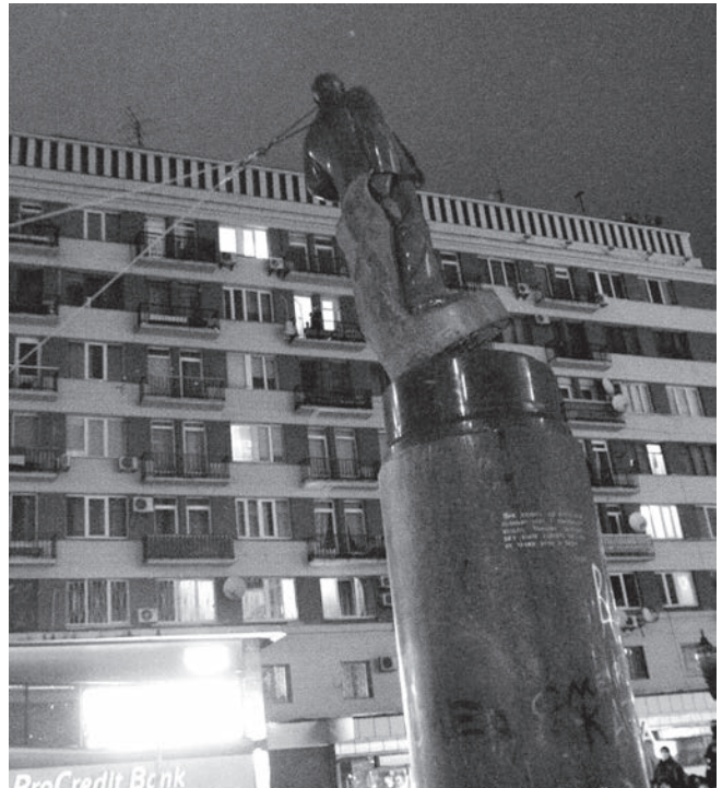
First Lenin statue toppled in Kiev, December 8.

You can hear them explain: "National Socialist themes are popular amongst some of us. A clean nation. Not like under Hitler but in our own way, a little bit like that." Asked about Russian speakers in eastern Ukraine and Crimea, they reply: "Those who like Russia, let them move to Russia.