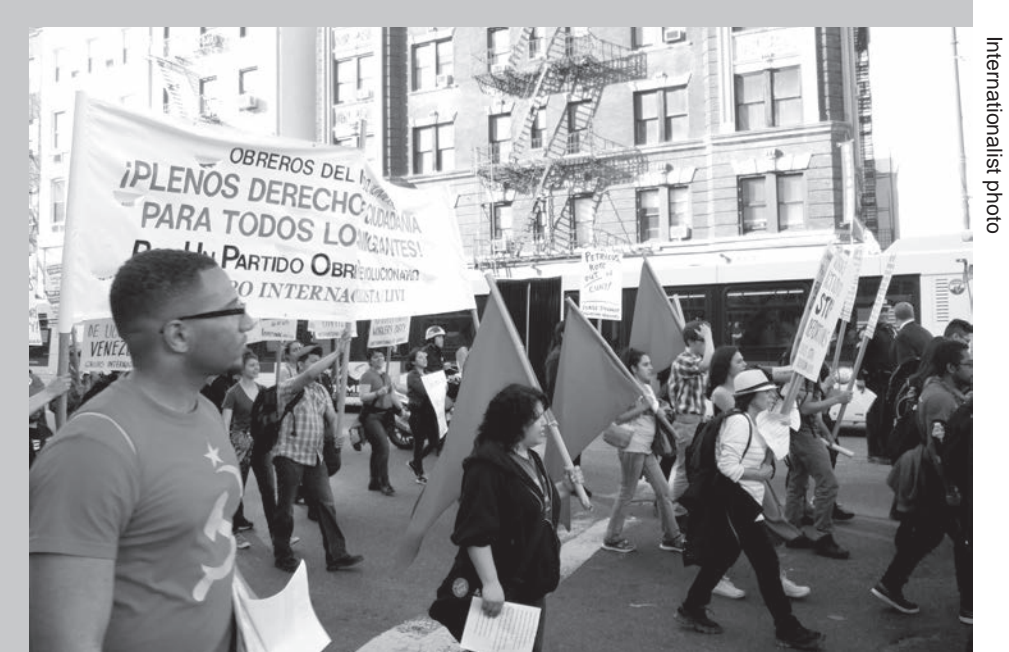
Internationalist contingent at 2014 New York City May Day march.

only want to sell their "merchandise" just like the capitalists of other drugs (tobacco, alcoholic beverages) and capitalists in general. Like the capitalists of the World Cup, they just want to make money!