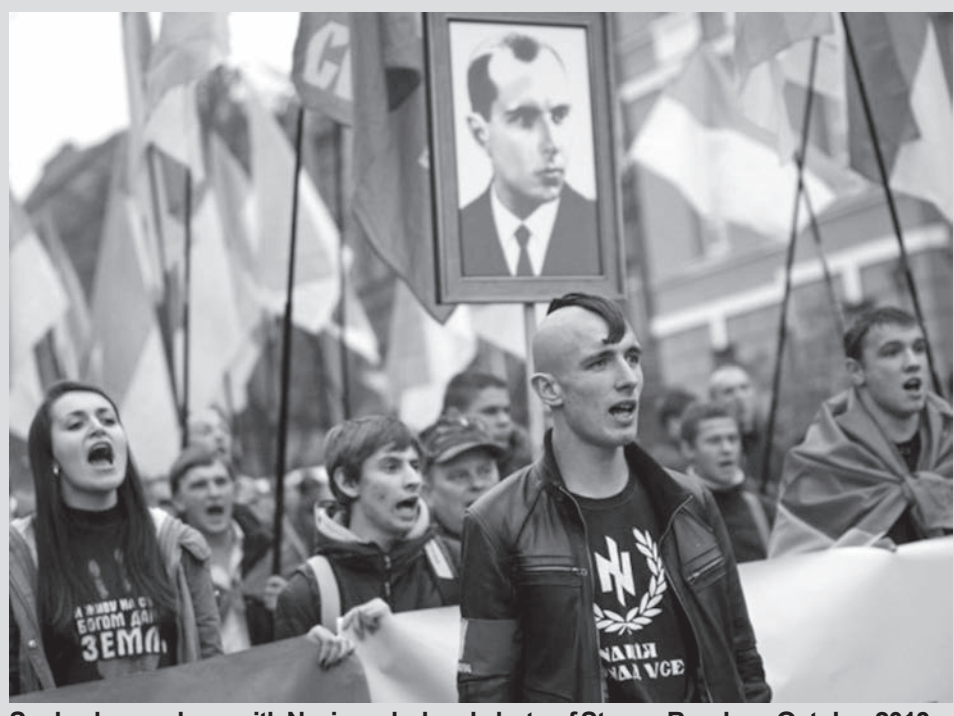
Svoboda marchers with Nazi symbol and photo of Stepan Bandera, October 2013.

nians, the UPA systematically carried out massacres of Poles in the Volhynia region (40,000 to 60,000 killed) and eastern Galicia around Lviv (30,000-40,000 killed).