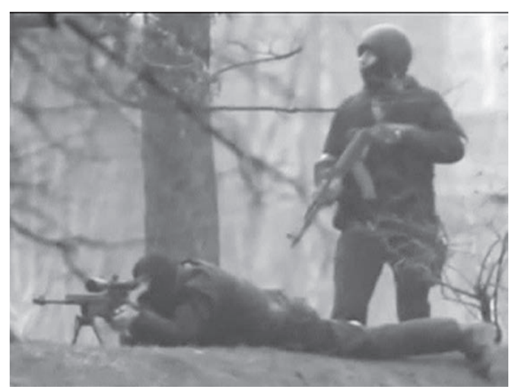
Snipers who shot down protesters and police on February 20. Whoever they are, these are not uniformed cops as claimed by the imperialist governments and media.

Editor's Note: Since this was first published on the Internet and in a supplement to The Internationalist, an important investigation by the German ARD TV network was broadcast showing in great detail that much of the deadly fire against the demonstrators on February 20 was from the protesters' HQ. See addendum at the end of the article.