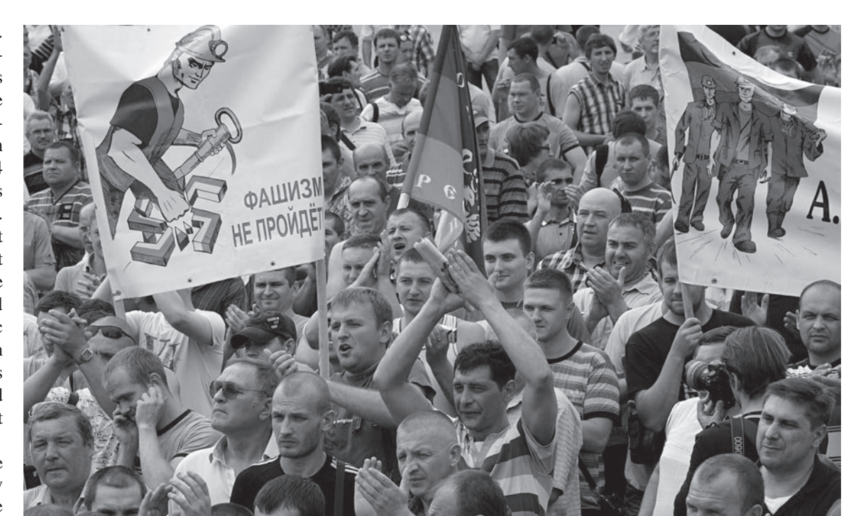
Coal miners rally in Donetsk, May 28, to demand end of military operation against uprising in eastern regions. Sign says: "Fascism Will Not Pass!"

Several other things indicate that the rebellion in eastern Ukraine is not just a creation of the Kremlin, to be turned on or off like a water faucet. For one, the April 17 statement agreed to by Russia stipulating that "all illegal armed groups must be disarmed; all illegally seized buildings must be returned to legitimate owners" and calling on rebels to surrender weapons was categorically rejected by the People's Republic leaders. Putin's call to postpone the May 11 self-rule referendum was likewise rejected by the insurgents. And a good thing, too, since the turnout demonstrated conclusively the mass support in the east for autonomy/self-rule.