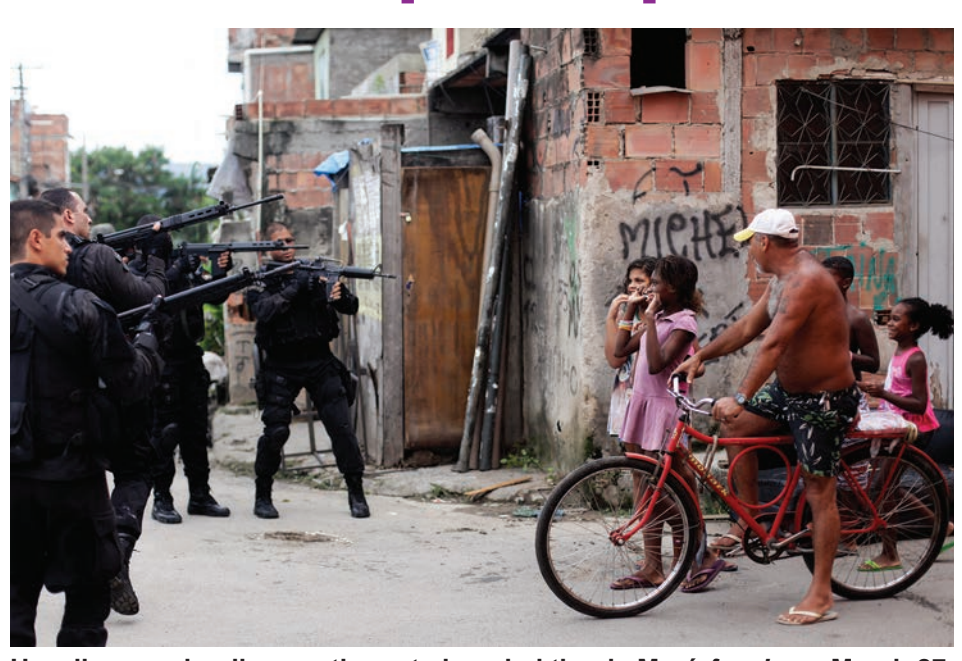
Heavily armed police contingents invaded the da Maré favela on March 27. In preparation for the World Cup of soccer, the popular-front government has imposed a state of siege on the poor neighborhoods of Rio de Janeiro.

ANNIVERSARY OF THE MILITARY COUP – March 31 marked the 50th anniversary of the civilian-military coup d'état that overthrew the government of Jango Goulart and installed 21 years of bloody military dictatorship, of torture, of disappearances, of repression against working people and the poor. Marches in the streets carry photos of the victims, proclaiming "Never Again." There are conferences, debates and films in the continued on page 2