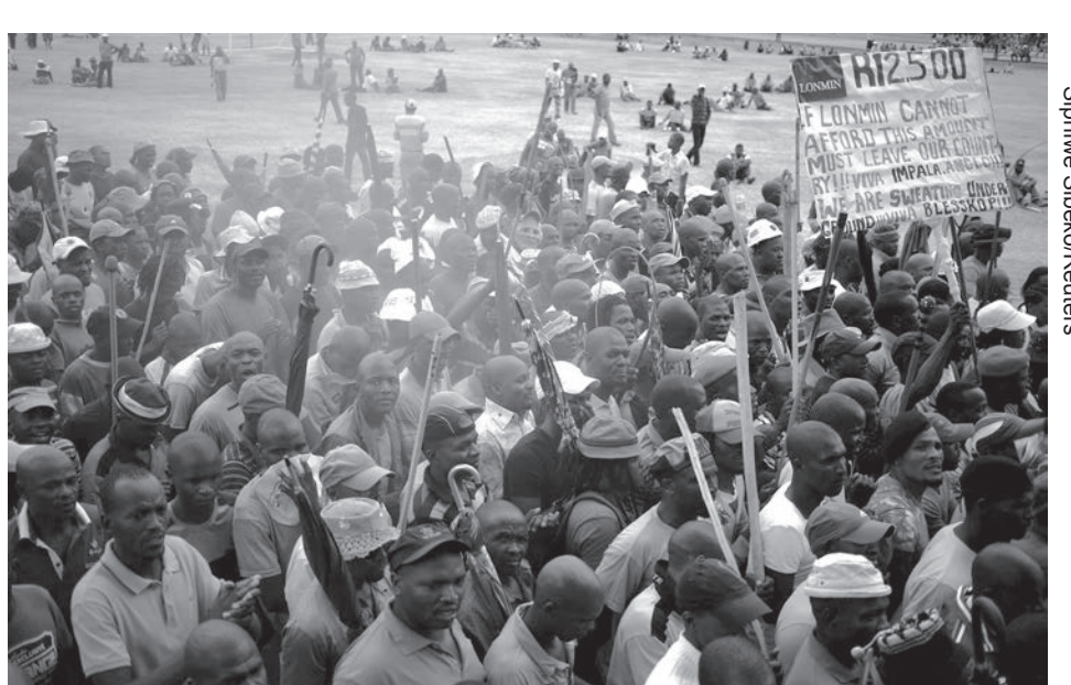
Striking platinum miners rally in Wonderkop stadium outside the Lonmin mine in Rustenburg, site of the August 2012 massacre.

All of the talk about AMCU "authoritarianism" and "concerns" about the union going into the strike "divided" evade the fact that the strike had already been decided, including by a vote at the January 19 rally. This all bears a striking resemblance to at-