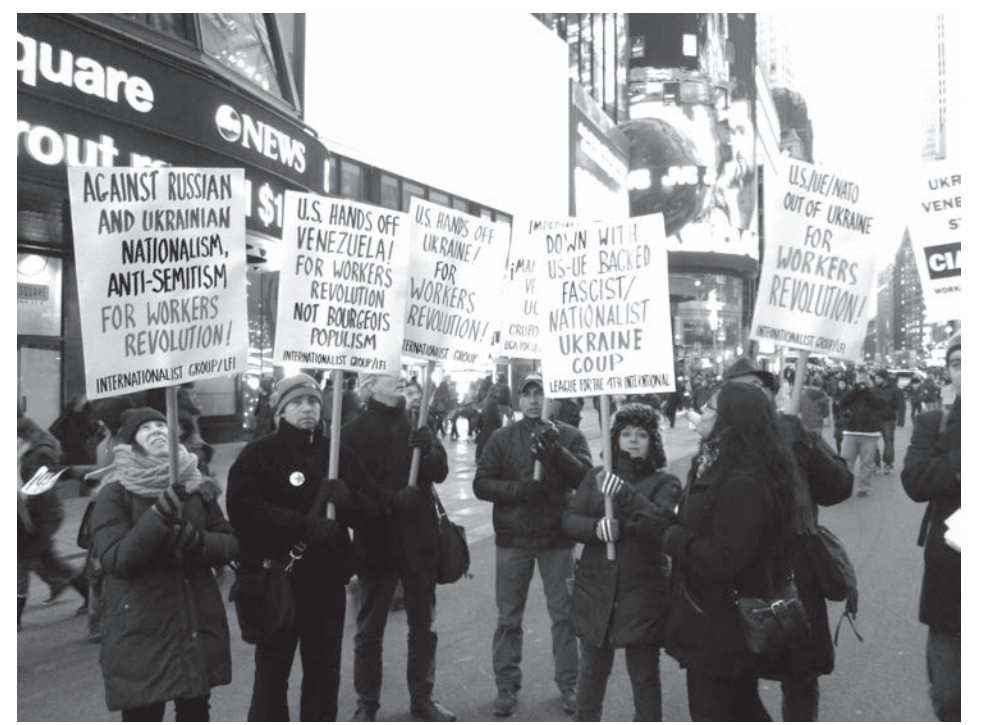
Internationalist Group/LFI at New York City protest, February 27, demanding U.S. hands off Ukraine and Venezuela.