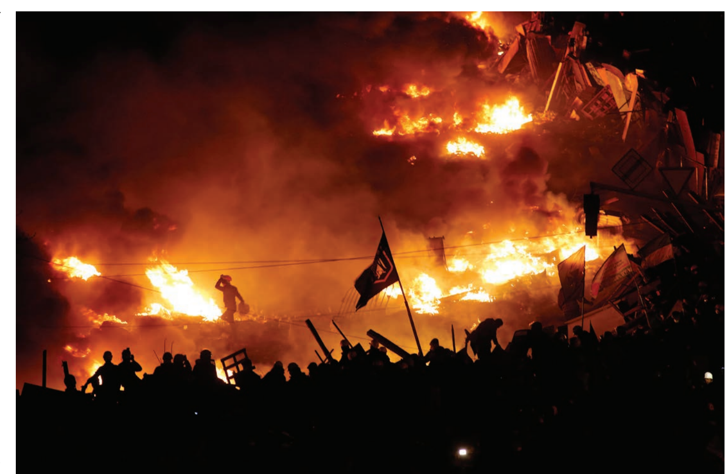
Fascist-led protesters set barricades aflame in Kiev's Independence Square, 20 February 2014.

Organize Workers Defense Committees to Defend the Favelas, Protests and Social Movements