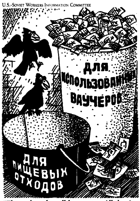
"The garbage has all been eaten. All that is left is used vouchers, which even the crows don't want." (From Solidarnost #4, 1993)

9. It is this latter alternative which we are now witnessing. What has brought us to this point was the failure of the revolution to extend to the West in the period since the 1920s, combined with