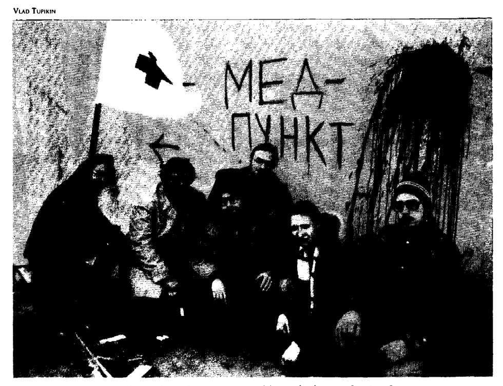
Anarchists and others formed a volunteer medical brigade during the October 3-4 events.

These policies have aroused bitter resistance from important sections of the Russian elite, including many industrial managers. The critics of Gaidarism do not, in most cases, dispute the goal of building capitalism in Russia. But they are appalled