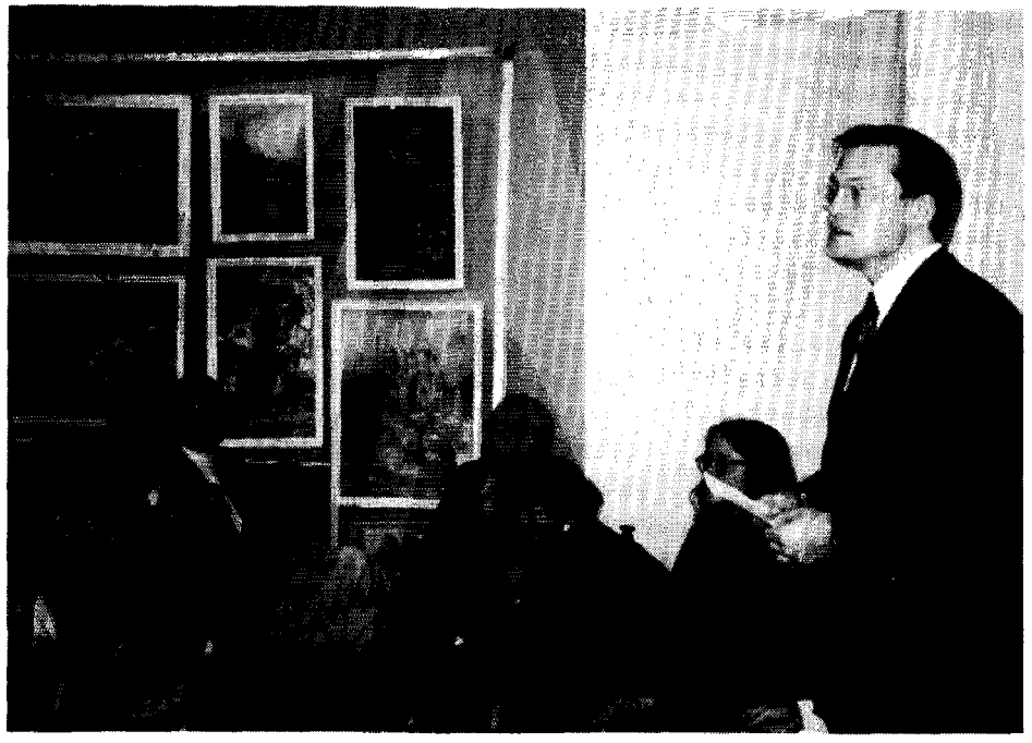
Moscow press conference of Committee for Democratic and Human Rights in Russia.