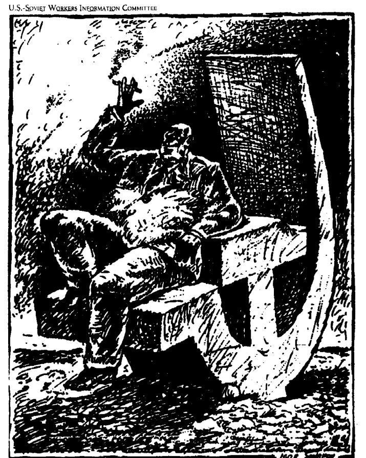
Moscow News #13, March 26, 1993

The struggles of the workers in Hungary in 1956, in Poland the same year and in 1970, the Czechoslovakia "spring" of 1968, and the original aims of the massive Solidarity movement in 1980 in Poland all pointed in this direction. But by the end of the decade, socialism itself was discredited, not only by the lack of democracy and internationalism on the part of the Stalinist regimes, but by their utter failure to keep the economy moving forward.