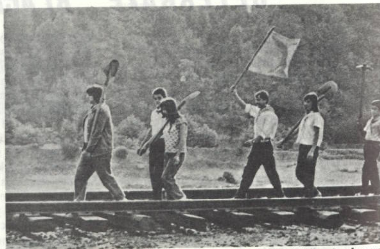
Young people of Albania play an

These sufferings and privations, this oppression and discrimina-