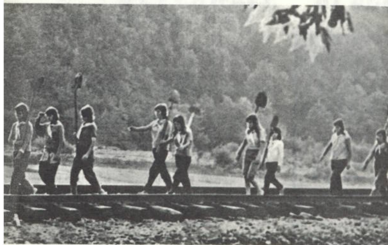
important role in their socialist society.

ia. Recently thousands of youth, pupils and students of New York, Boston, etc. pitched into the stern class struggle to defend their rights. The French youth too have taken an active part in the strike struggle. More than 200,000 young men and young women of Paris, Nantes, Marseilles, etc., took to streets chanting