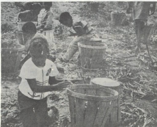
Young children go to work in the fields at an early age to help their families survive.

This means that I started to work in the cotton fields at 8 years old. I've learned everything there is to farming except plowing. And I would have learned plowing, but my father wouldn't trust me with the plow because I would plow up everything in sight! I had to stop school in the ninth grade because of the death of my