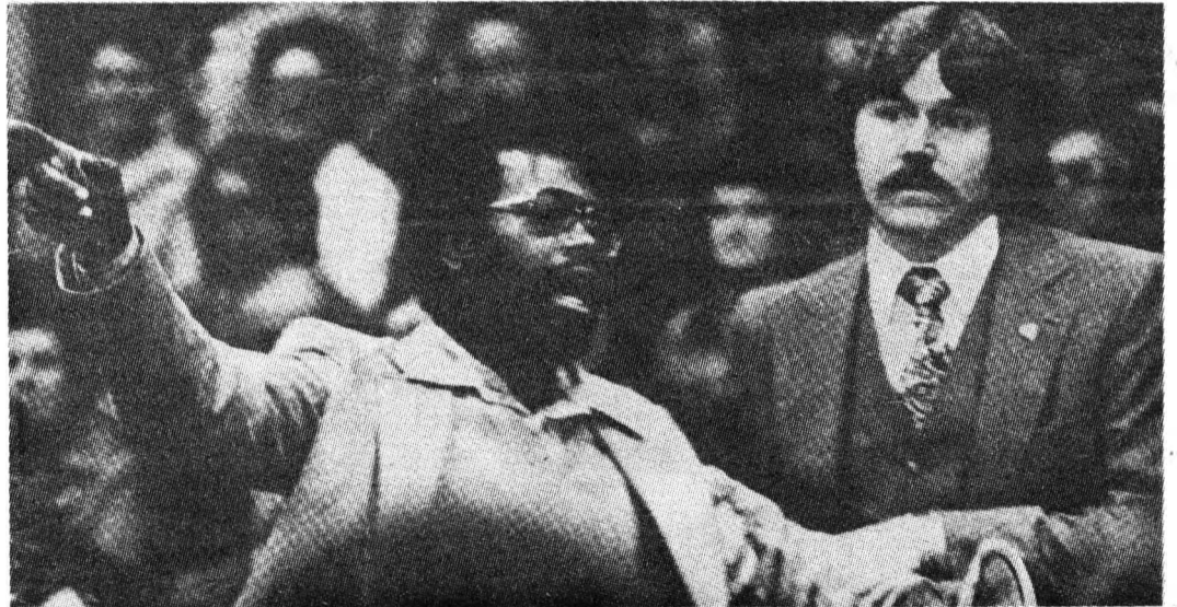
Washington, D.C., Dec. 5—Kennedy Disrupted—A Secret Service agent takes a protester by the arm and removes him from the Shiloh Baptist Church in Washington as Senator Edward M. Kennedy addressed the congregation. Kennedy was interrupted three times by the protesters.

...nted to the general body. One noted, the conference didn't begin for her "until the work... Then just after the high point conference when the call for a demonstration in Greensboro... aided by all, IFCO and SCLC... voted the resolutions saying steering committee would disband and abruptly adjourned the... People were shocked and disappointed. The resolutions... real fruit of the two-day... should have been discussed... on by the general body so... could be greater unity. The... is crystallized people's... concrete plans of actions... adopting them weakens the... ion for the demonstration... ssing and voting on the reso... the open conference floor... folk's worst suspicions about... cried loudest for unity. ... Communist Workers Party's... e at the conference in working... d united front based on equal... d all the lies and rumors that... doesn't want to work with... The Communist Workers Party... ue to work tirelessly to unite... n be united to beat back Klan... nd avenge the Communist... arty 5.