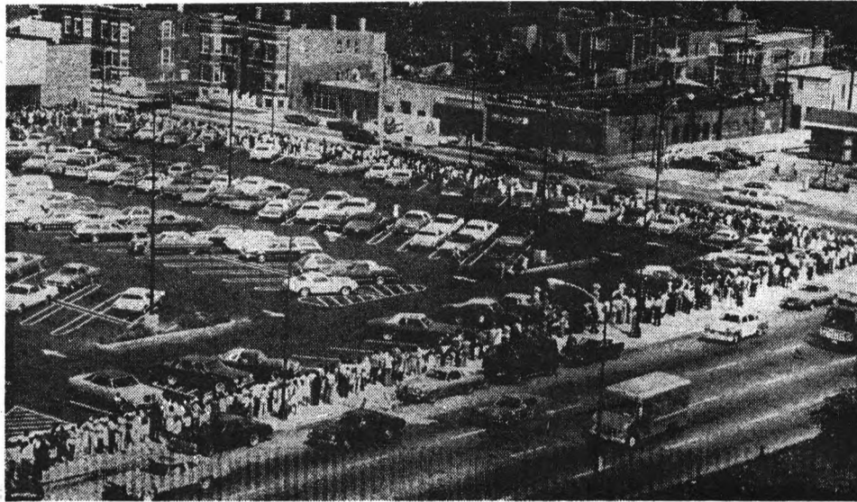
The job riot in Detroit could have happened with these 2,000 Chicagoans who lined up for 300 jobs on the only day applications were given.

Yours in struggle, D.D. Detroit, Michigan