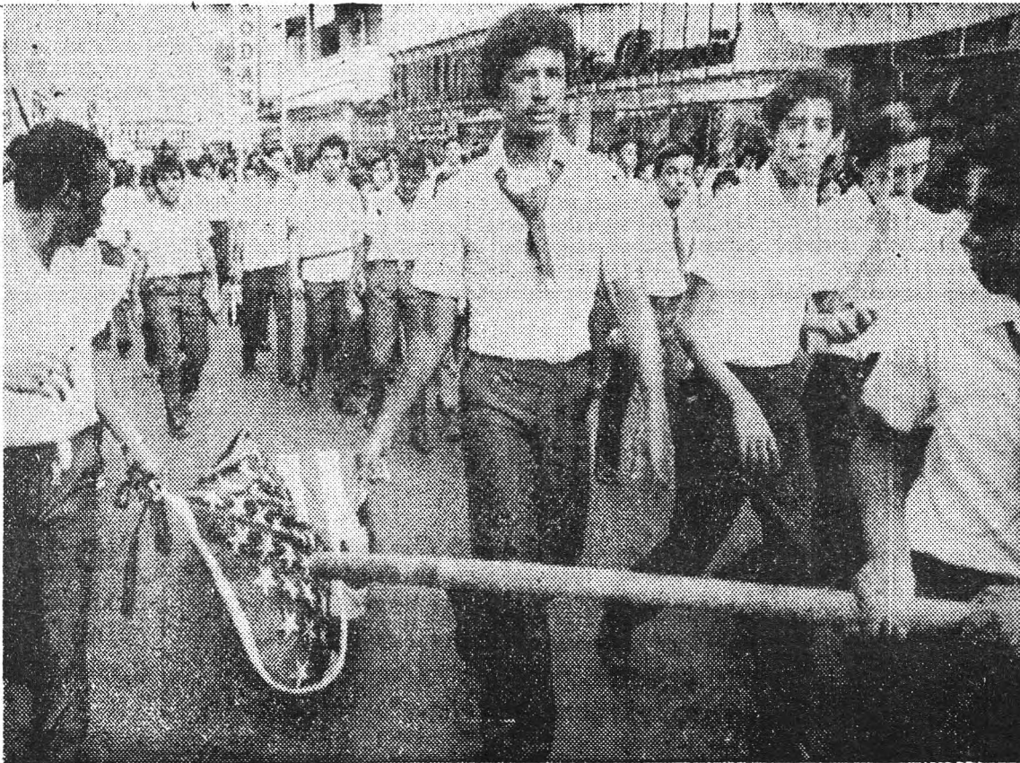
Panama: Demonstrators dragging a United States flag in Panama during protests against the Shah's presence in the country.