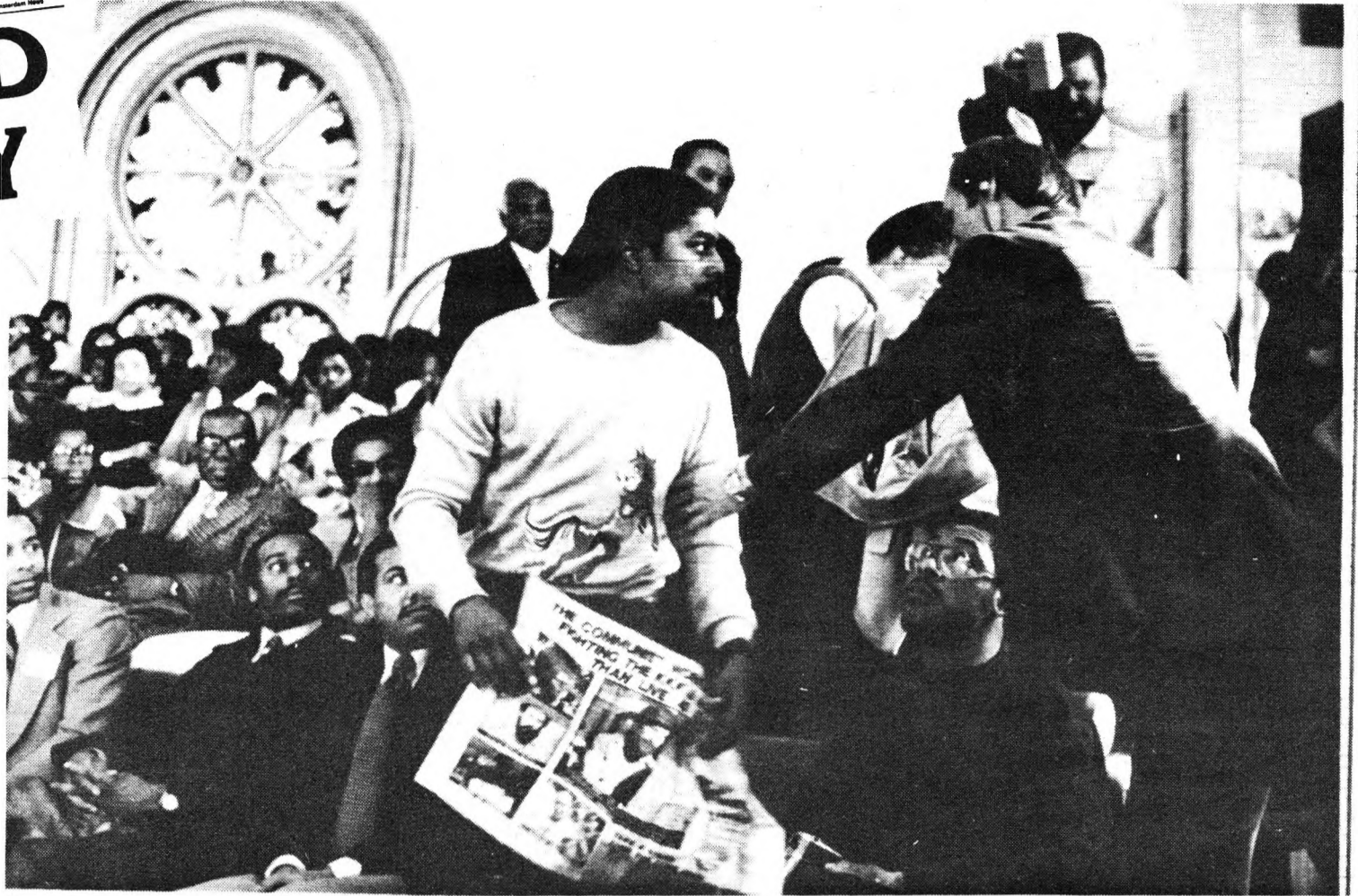
(Amsterdam News, Dec. 15, 1979)

With them there on the street was the contingent of the Committee to Avenge the Communist Workers Party 5, whose placard read: "Carter's Human Rights Is..." Their leaflet stated: "Carter, Kennedy, you're the same; the capitalist crisis is to blame. Carter, Carter you're a... You send the Klan to stop our..." This was a reference to the November fatal shooting in Greensboro, N.C. "by an army of 25 KKK/Nazis and FBI agents," according to the Committee, of five members of the Communist Workers Party. The five were Communist Workers Party leaders on an anti-Klan march. After the tumultuous session at Salem, the girl who began the interruption identified herself as a member of the Committee to Avenge the Communist Workers Party 5.