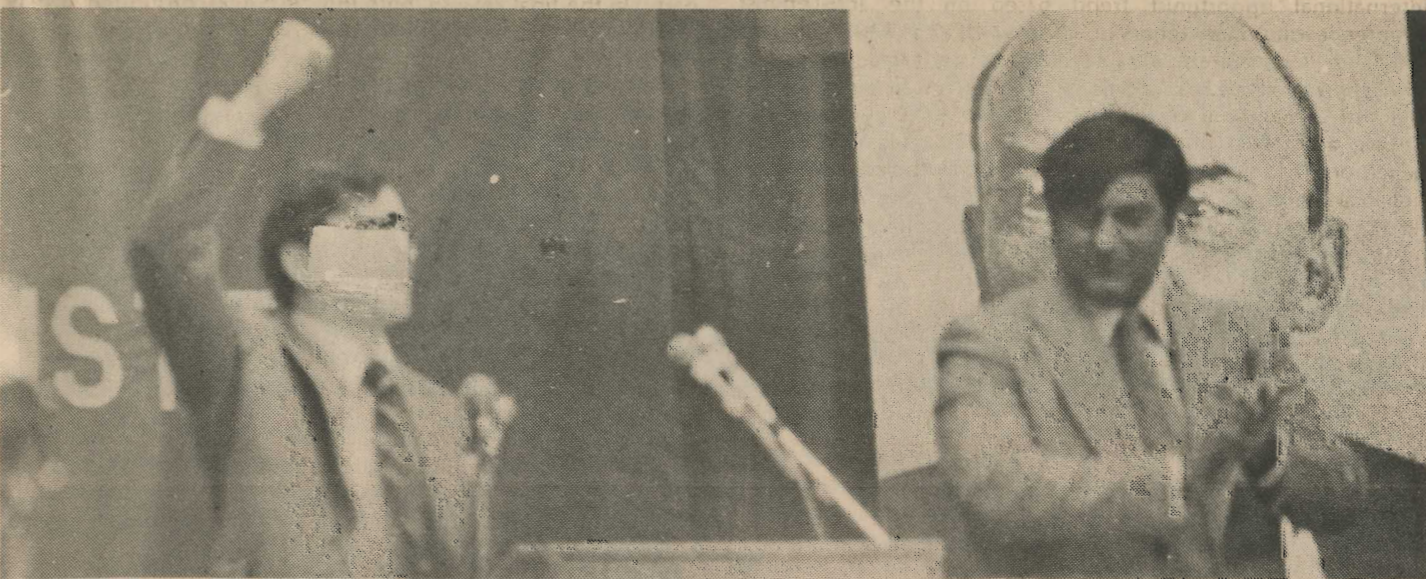
Representative of the Central Organization of U.S. Marxist-Leninists tumultuously applauded by the Internationalist Rally.

When the representative of the Tunisian Worker finished delivering his speech, sustained and vigorous applause showed the enthusiasm with which all the participants welcomed the comrade from Tunisia. The slogans Long Live Proletarian Internationalism! and Workers of All Countries, Unite! were shouted time and time again.