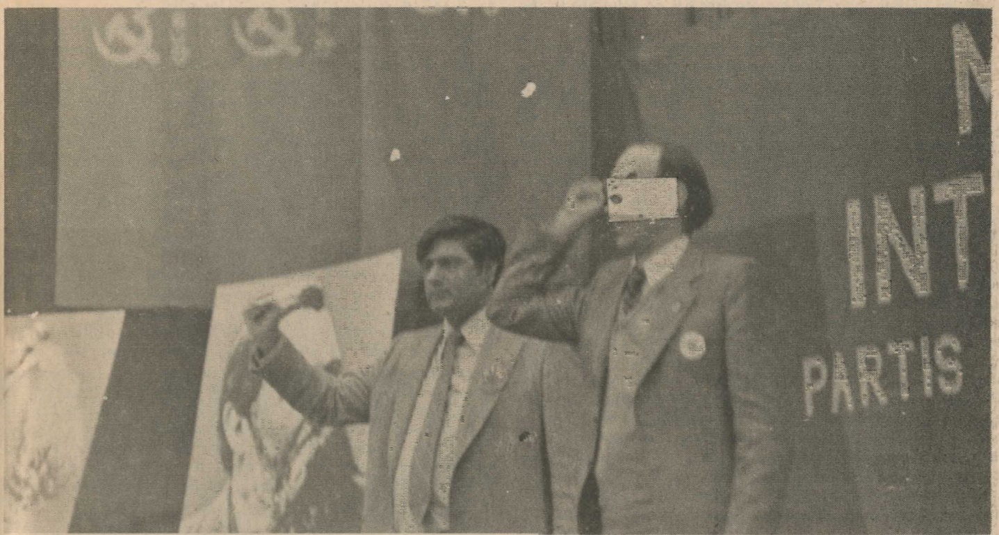
Representative of the Communist Party of Spain (Marxist-Leninist) addressing the Internationalist Rally.

The working class has long known that these states are the representatives of big financial monopolies which themselves are instruments in preserving this oppressive system. The answer of the working class is quite clear: it knows that the capitalists will never