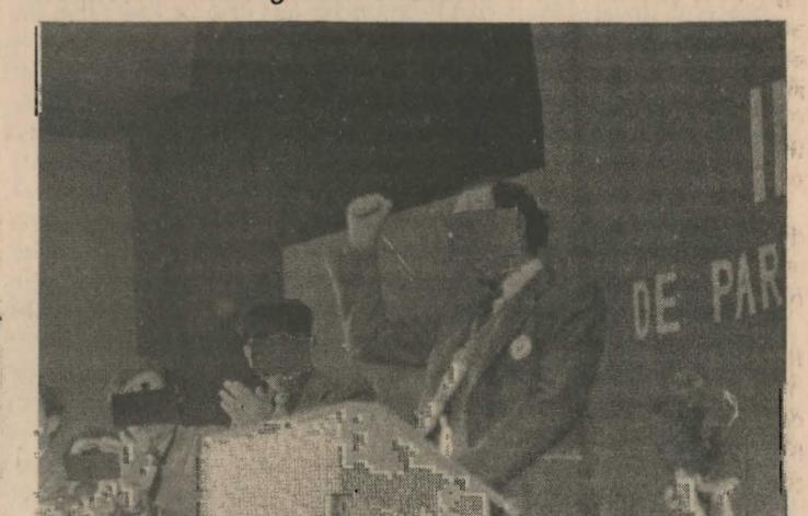
Representative of Communist Party of Spain (Marxist-Leninist) delivers Message of Greetings to the Internationalist Feast.

The message of greetings was received by the participants in the Internationalist Feast with boundless joy and enthusiasm. Shouts of Long Live May First! and Long Live Proletarian Internationalism! , etc. thundered throughout the hall.