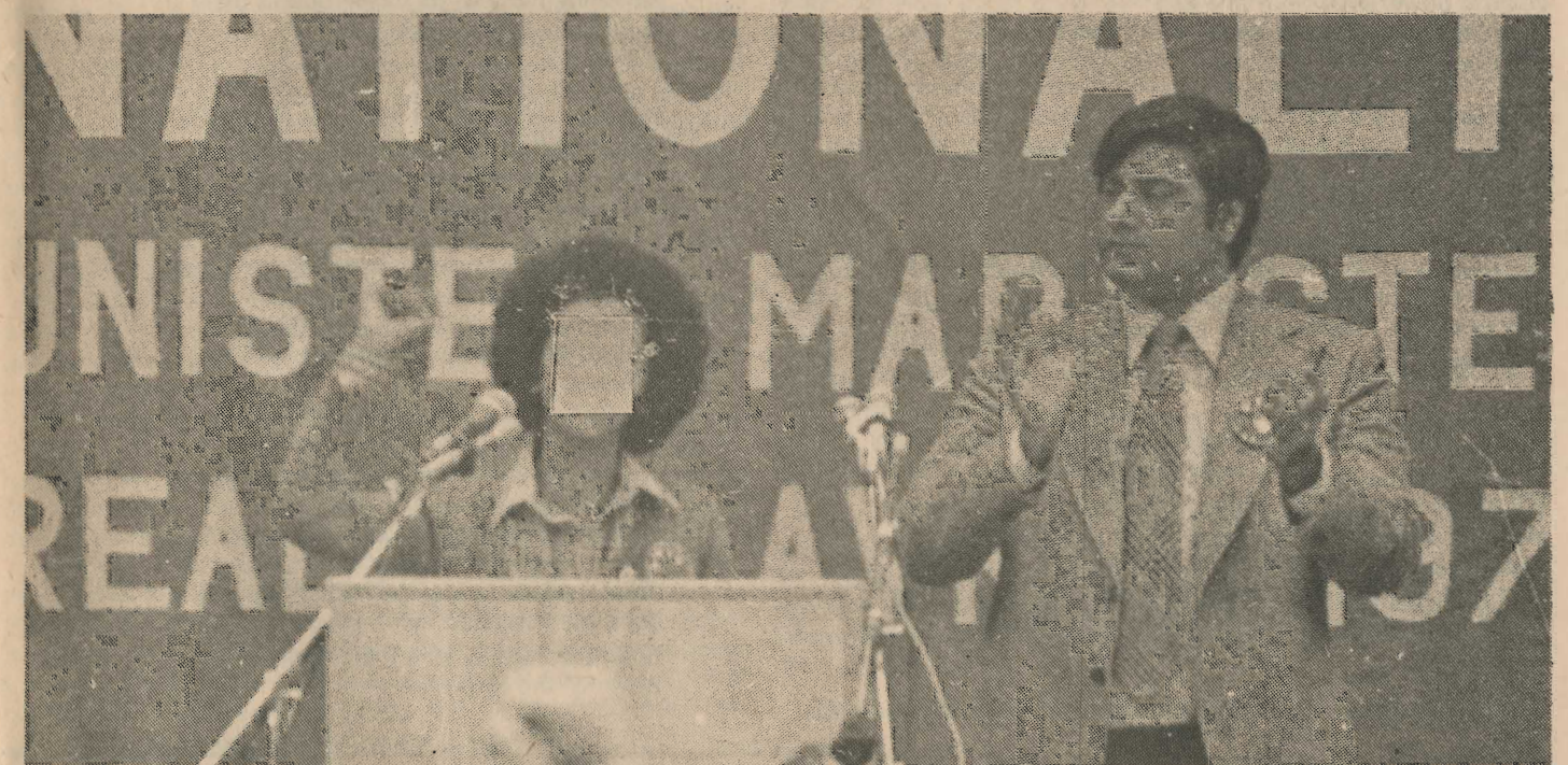
Representative of the Association of Eritrean Women in North America addressing the Internationalist Rally on behalf of the Eritrean People's Liberation Front.

The birth of EPLF was a new chapter in the history of our people's militant struggle. It meant the rebirth of the Eritrean struggle on a new revolutionary basis, on the basis of the national democratic line. The EPLF became the rallying force of the revolutionary and democratic forces of our people's liberation struggle. It aroused the deepest sentiments of the workers, peasants, the revolutionary intellectuals and other democratic forces of all the nationalities of our country. The EPLF's correct line and leadership has become the prime condition for the tremendous growth of our revolution. The Eritrean struggle has gone through many twists and turns and has traversed a difficult and arduous road of bitter struggle. We have paid thousands of lives for freedom and true liberation. Many