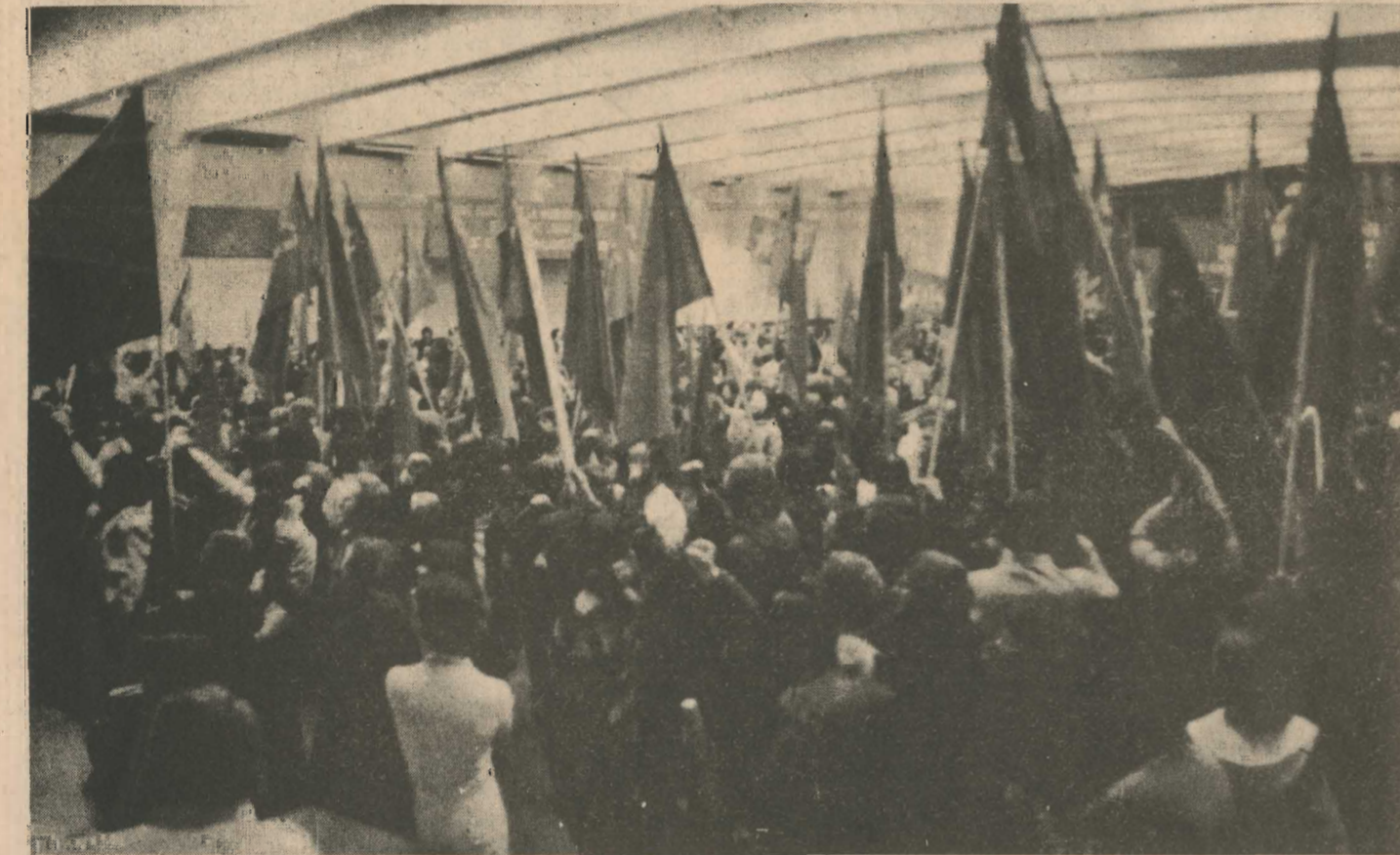
Photo shows the Communist Party of Canada (Marxist-Leninist) contingent at the May First demonstration which marched throughout Montreal, ending at the meeting hall for the Internationalist Feast. Waving bright red flags and the banners of the demonstration, the comrades marched through the meeting hall, clenched fists raised high, shouting slogans.

In celebration of May First, the day of international working class solidarity, the Canadian Workers' Association organized the Internationalist Feast to express the fighting solidarity of the working class in Canada with the workers of the entire world in their titanic struggle for the triumph of the revolution and socialism against imperialism and world reaction, led by U.S. imperialism and Soviet social-imperialism, and against revisionism and opportunism of all hues.