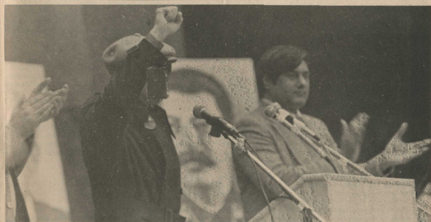
Representative of the Workers' and Peasants' Communist Party of Iran (tumultuously applauded by the Internationalist Rally).

Dear Comrades, Following the betrayal of the Khrushchovite revisionist clique in the Soviet Union, which was once the cradle of socialism and the