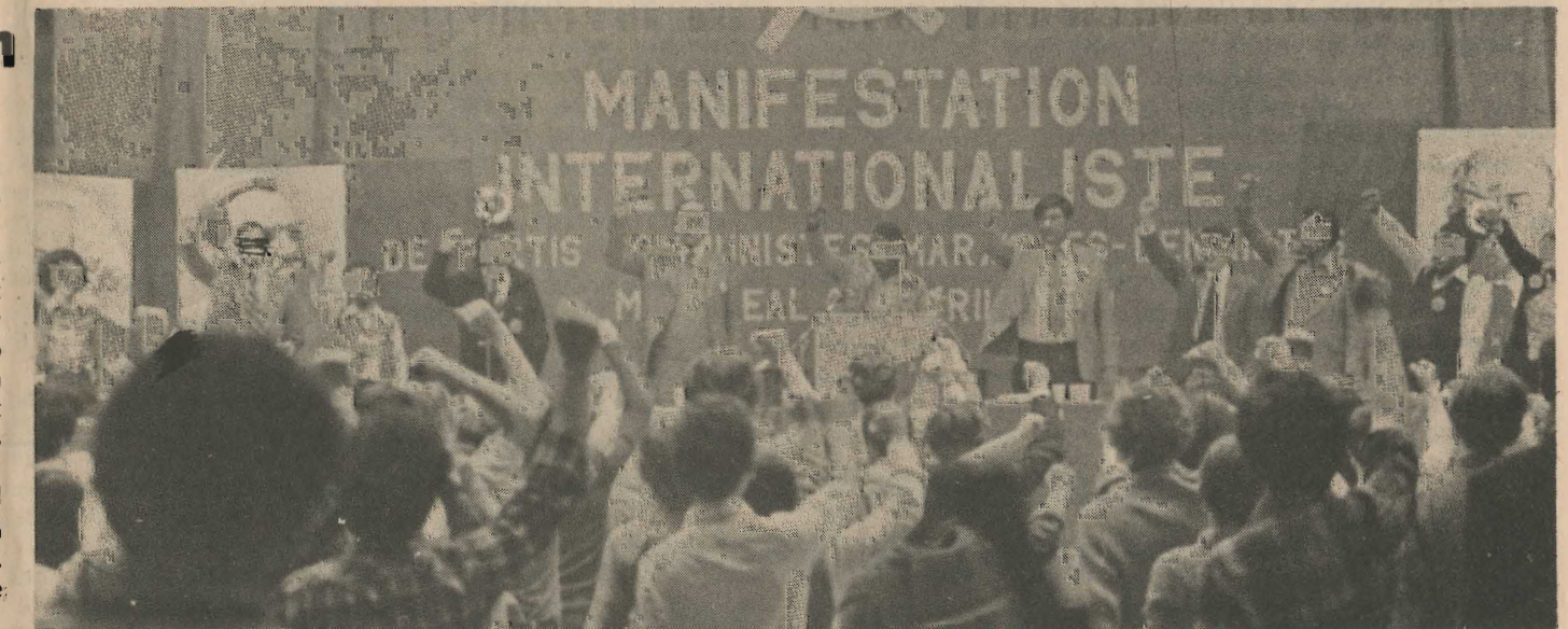
Representative of the Zimbabwe African National Union tumultuously applauded by the Internationalist Rally.

As our war goes on, needs are demanding. Right now, ZANU is busy sending ZANLA fighters into liberated areas in the thousands. The London Observer reported on April 23, 1978 that 5,200 ZANLA guerrillas had finished training and were on their way into