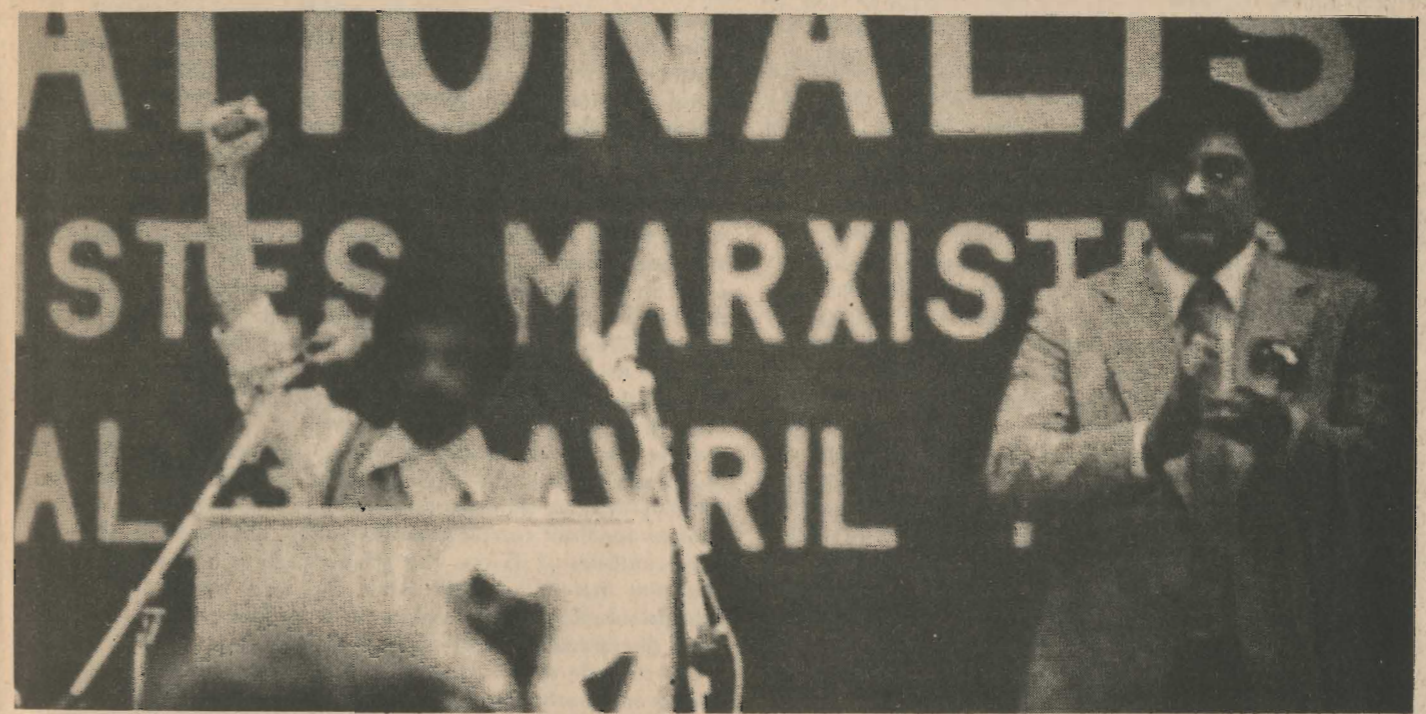
Representative of the Marxist-Leninist Organization, the Tunisian Worker, tumultuously applauded by the Internationalist Rally.

The workers' movement is vigorously developing. In the past year the strikes and other struggles have gained in intensity and scope. Uniting growing numbers of workers into militant participation in the active resistance to increased capitalist exploitation. The strike struggles of the workers are more and more frequently breaking out, despite the restrictions imposed on them by the reactionary state and the labour lieutenants of capital, signalling that the strikes of today are but the preparation for far greater class battles in the future.