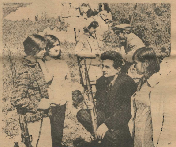
In the U.S., the armed forces are for the suppression of the people. But in Albania, along with the army the entire people are armed to defend the socialist homeland from the attacks of imperialism and reaction. They build socialism with 'the pick in one hand, the rifle in the other.'

lence for the brutal suppression of the working class and oppressed masses. Any important class conflict which threatens their interests and profits, the capitalists inevitably resolve by force. The workers' strikes and demonstrations are suppressed by the enormous police forces which are constantly being strengthened against the revolt of the masses. Unlike the free elections under socialism, the elections that are held under U.S. capitalist "democracy" are a