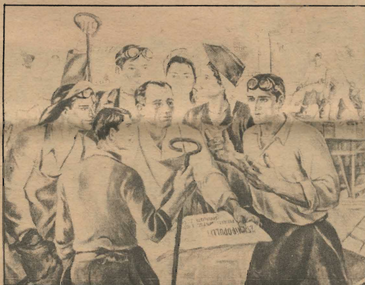
Drawing depicts factory workers discussing the Draft Constitution of socialist Albania in 1976. This was part of a great popular discussion involving virtually the entire adult population. During this, an ordinary peasant said, "To the poor, the word 'law' once had a terrible sound. It meant a threat of starvation, a threat of imprisonment, a threat of death. Today the people make the laws themselves and they do so for their own good."

The capitalists try to frighten the people by raving against the socialist state as "tyranny," "dictatorship," etc. They shout about "democracy" only to hide the truth about the dictatorship of the bourgeoisie. The capitalist state means democracy only for the rich ruling class, while it is a machine of vio-