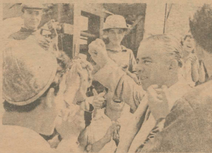
Comrade Enver Hoxha, First Secretary of the Central Committee of the PLA, among the Albanian masses. The great strength of the Party lies in its loyalty to Marxism-Leninism and its unbreakable links with the people.

In all countries, the working class needs its party. The work and struggle of the PLA teaches important lessons for the socialist revolution in the U.S.