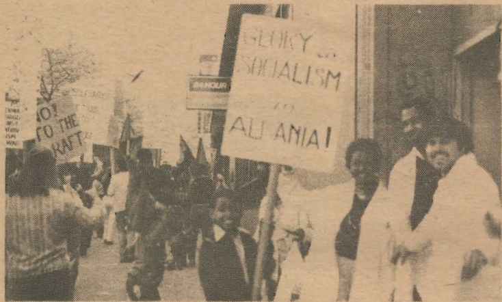
May Day action in New York City, 1980: Socialist Albania inspires the workers of the whole world. Photo shows the enthusiasm of the masses for socialist Albania in a demonstration organized by the Marxist-Leninist Party, USA.

Red salute to the Albanian people! Glory to socialism!