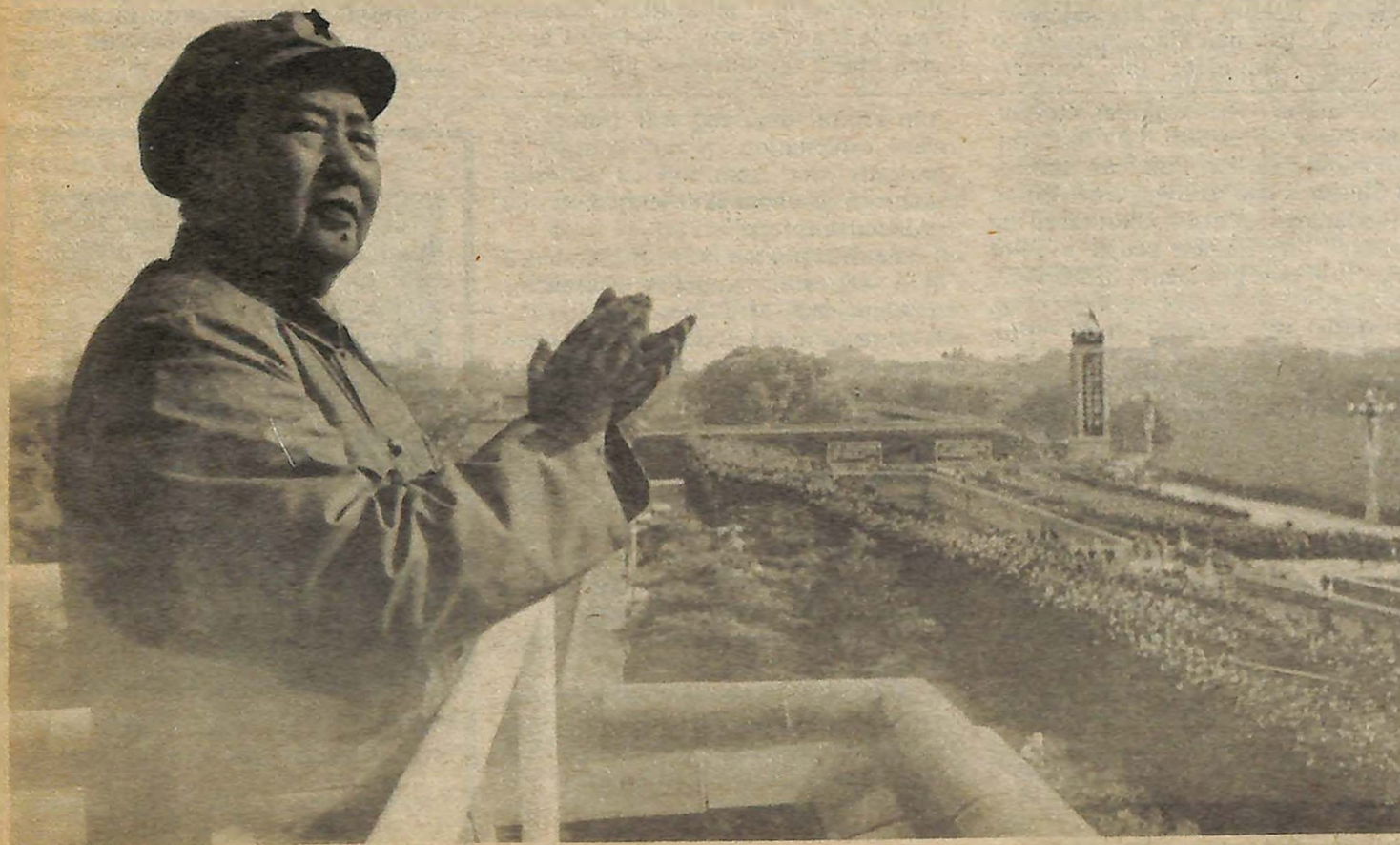
Mao Tsetung applauds a mass rally of Red Guards during the Great Proletarian Cultural Revolution.

“In 1957 it was necessary to beat back a handful of rightists. However, in the course of struggle a mistake was made in enlarging it. In 1958 in directing the economic work the objective laws were violated, deviating from the principle of thorough investigation and study, and testing out everything first, and made mistakes of ‘blind commandism,’ ‘over-exaggeration,’ and ‘communist wind.’ In 1959 within the Party the struggle against so-called right opportunism was inappropriately launched.”