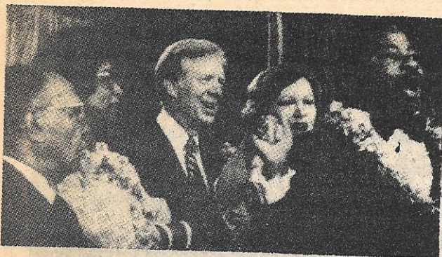
President Carter and NAACP delegates sing "We Shall Overcome" at NAACP convention on July 4.

— especially that sector that banked so heavily on the Carter administration to rescue them from the crisis, only to have those hopes dashed — have raised the banner of independent black politics to regain the lost positions won during the black power movement during the 60's.