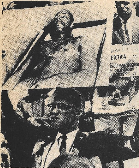
Malcolm X at the head of a massive 1962 demonstration to protest the murder of several blacks by the Los Angeles Police Department.

the reformist leaders to merciless criticism. Malcolm was turning the corner to Marxism.