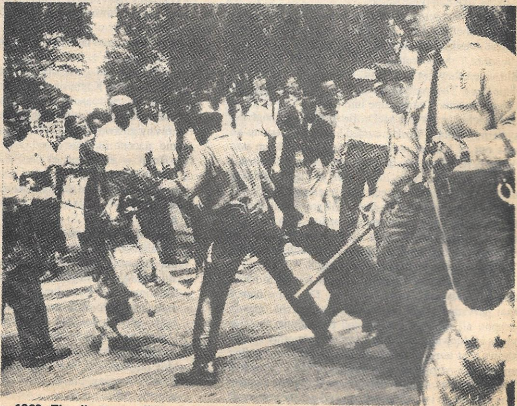
Birmingham, Alabama, 1963. The disastrous effects of non-violent tactics: An Afro-American worker attacked by trained dogs.

Advanced elements were beginning to identify with armed self-defense advocated by Robert Williams who in 1958 organized the Monroe (N.C.) chapter of the NAACP into a rifle club. After a complete whitewash of a white police officer's murder of a black youth, Williams said, “It's clear that we can't get any justice