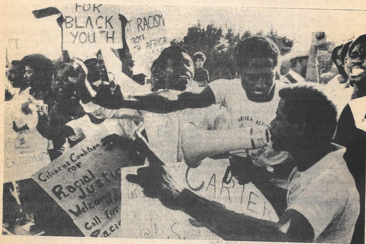
Miami blacks after running Andrew Young out of town, denounce Carter and the NAACP misleaders during the 1980 NAACP convention.

So as soon as the Keynesian tricks of the 60's played out, the illusory liberalism of the Democratic Party evaporated and the true nature, the openly reactionary nature of U.S. imperialism, stood out clear as day. Partial concessions were replaced with subterfuges and pitting tactics to split white workers and oppressed nationalities. In the early 70's this was done by taking the genuine demand of Afro-Americans for quality education and the right to go to the school of their