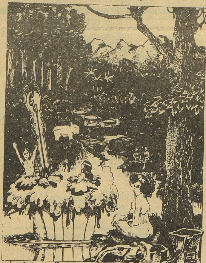
ice cream descriptions • NOTHING STRIKES BACK • *ON THE DRUG*

Non-profit help for all whales 9616 MacArthur Blvd. Oakland, Ca. 94605 Dept. 127 Anti-whaling information and $10 memberships available