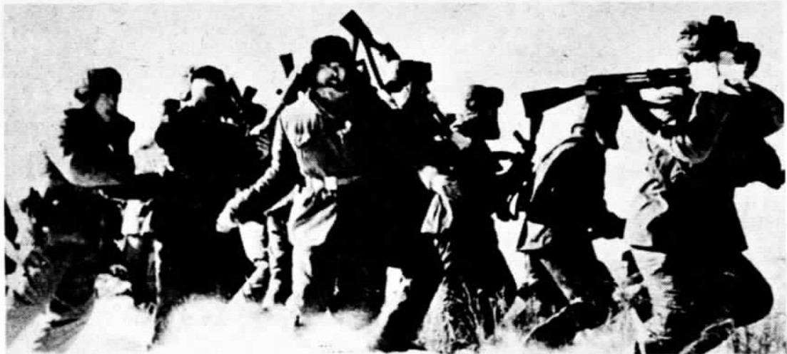
Chinese soldiers resist Soviet intrusion at Chenpao Island, 1969.