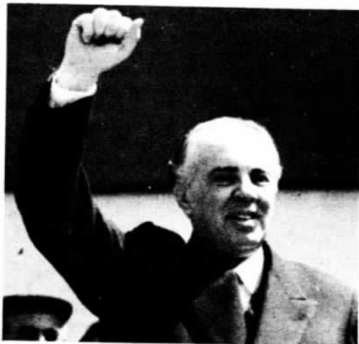
Albania's Hoxha, critic of revisionism.

While maintaining that the CPSU was the "leading party" insofar as the Chinese were concerned, Teng said this did not mean such a party was above criticism. Stressing the difference between fractionalism within a party and between parties, he insisted China had the