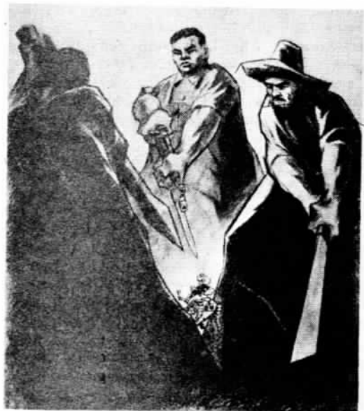
Cartoon Group of Peking

them to do so. It is therefore wrong to apply peaceful coexistence to the relations between oppressed and oppressor classes and between oppressed and oppressor nations, or to stretch the socialist countries' policy of peaceful coexistence so as to make it the policy of the Communist parties and the revolutionary people in the capitalist world, or to subordinate the revolutionary struggles of the oppressed peoples and nations to it."