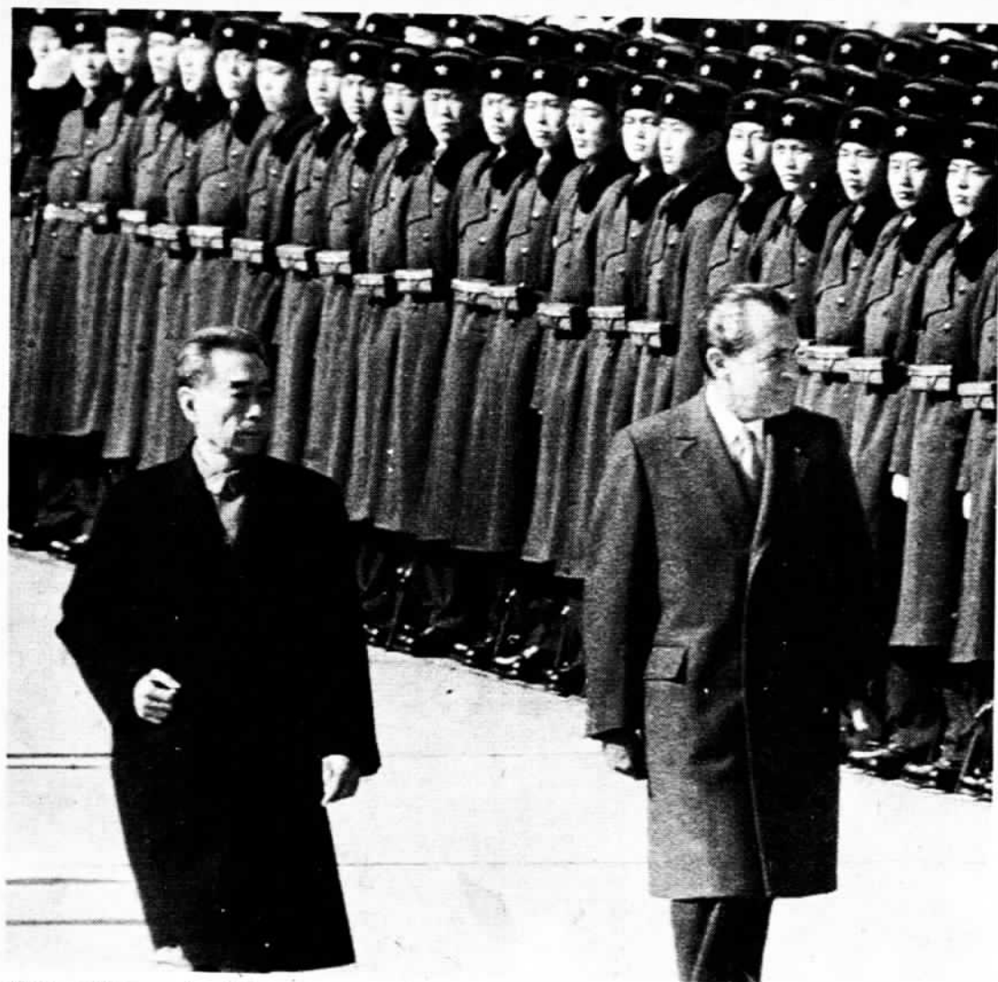
Nixon and Chou review Chinese honor guard at Peking airport.