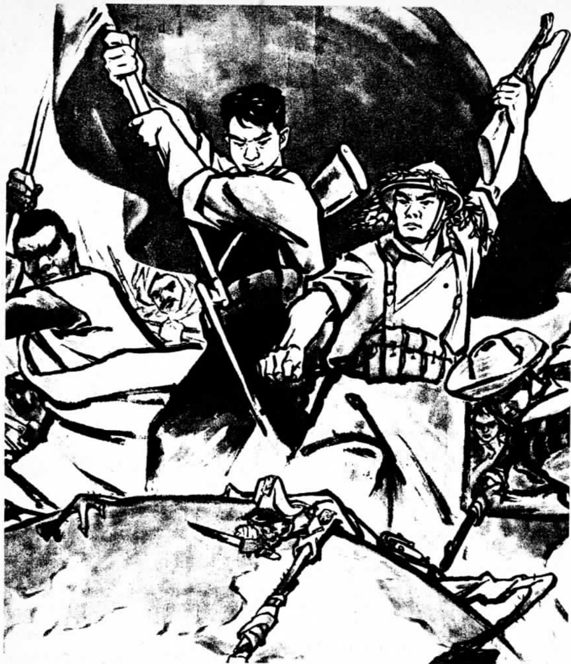
"Break the backbone of the U.S. aggressor" (Chinese poster).