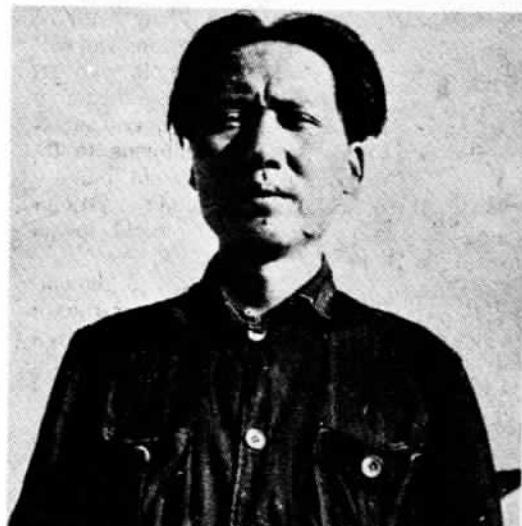
Mao at revolutionary base in Yanan, 1937.

no longer supports revolution. The Nixon visit, Pakistan, Ceylon, the superpower question and several other issues have engendered controversy within the revolutionary left.