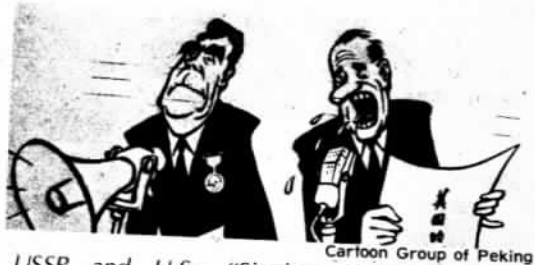
USSR and U.S.: "Singing the 'same tune'" (Chinese cartoon).

Before discussing China's policies from 1969 to today, it is necessary to examine some of the major theoretical differences between the CPC and CPSU, since these have a profound influence on present Chinese policies.