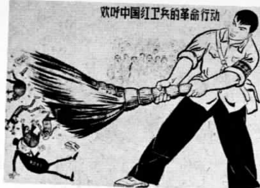
Cartoon Group of Peking

"Sweep away all monsters!" (Chinese poster).