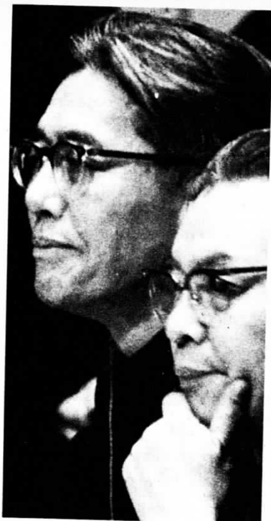
Deputy Foreign Minister Chiao Kuan-hua and permanent UN representative Huang Hua at UN November 1971.

First, Washington's Asian policy was completely out of date and was failing. It was ridiculous to pretend it was any longer possible to "contain" China. Second, Nixon took advantage of the Sino-Soviet split by creating enormous apprehensions in Moscow about Washington's intentions in Peking. The purpose, which appears to be in the process of being rewarded, was to force the USSR to accelerate its collusion with the U.S. in economic and other areas. Third, Nixon was looking toward his election campaign and there is no doubt his new China line was popular with the American masses (that the people responded favorably to a big reduction in U.S. hostility is a good thing, proving once again that despite decades of anti-communist brainwashing, the American people