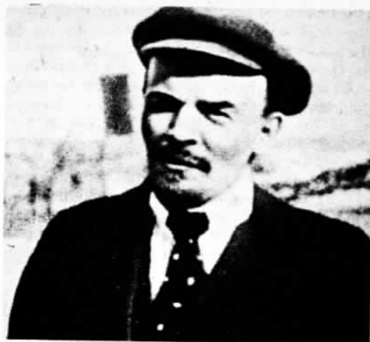
Lenin—"further developed" or distorted?

principle of peaceful coexistence as "further developed" by Khrushchev, but left room, no doubt after considerable Chinese pressure, for revolutionary struggle.