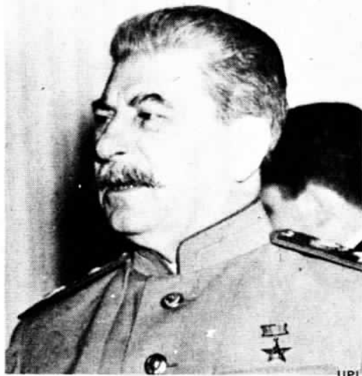
Stalin: some differences in strategy.

The CPC was born at its first national congress in Shanghai, July 1, 1921. "Let us thank the great Lenin," the CPC declared in its 50th anniversary history. "The 1917 Russian October Socialist Revolution led by him brought the Chinese people Marxism-Leninism." But on some occasions during China's revolutionary struggle,