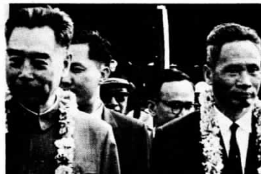
UPI Chou and DRV Premier Pham Van Dong, 1965.

At the January 1963 congress of the Socialist Unity Party of Germany, China was again attacked. When the Chinese delegate criticized Yugoslav revisionism, the delegates booed, stamped and whistled. The chairman denounced