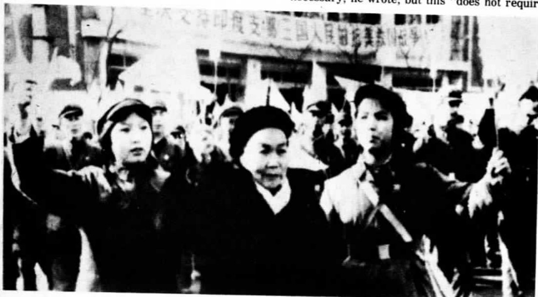
An estimated 300,000 people demonstrated against U.S. aggression in Vietnam, Chungking, Feb. 1971.

Compromise on certain issues may well be necessary, he wrote, but this "does not require