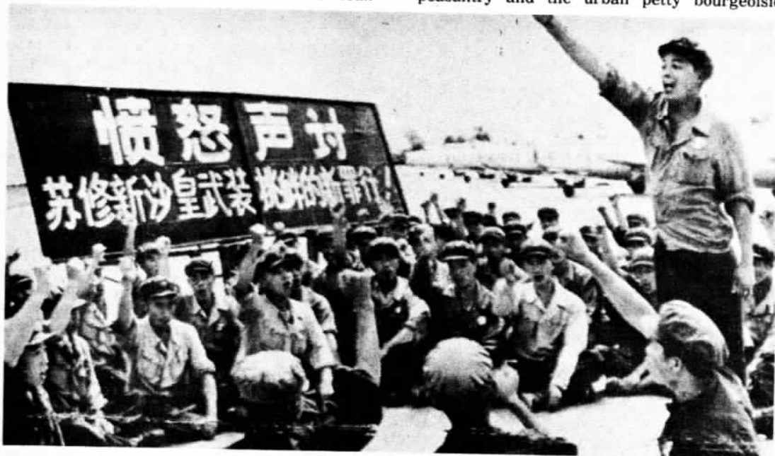
People's Liberation Army soldiers pledge to resist any Soviet provocations.

The progressive forces were the proletariat, peasantry and the urban petty bourgeoisie.