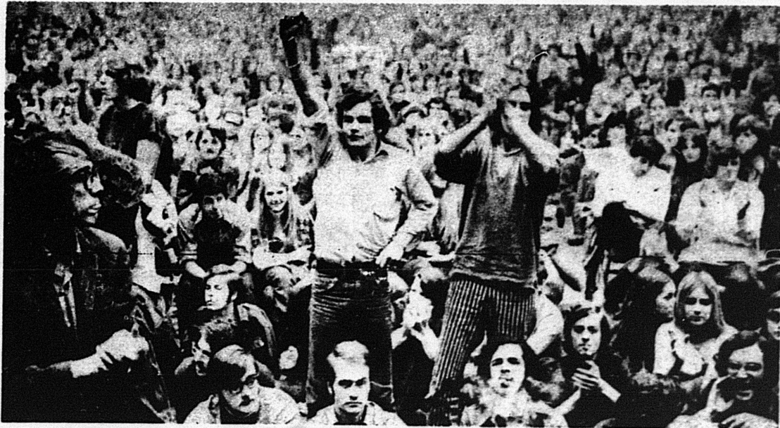
WHILE TRUDEAU'S FASCIST ARMY INVADES QUEBEC, 3,000 MILITANT QUEBEC STUDENTS HOLD A MASS RALLY IN MONTREAL SUPPORTING THE NATIONAL LIBERATION STRUGGLE AND THE F.L.Q.

To impose fascist rules and regulations on to the people -- to ban the distribution of all progressive revolutionary literature, to outlaw the holding of progressive meetings and rallies, to impose injunctions to break working-class strikes, to carry through their overall plans for fascist suppression of the working and oppressed people -- the bourgeoisie must first eliminate the revolutionary associations of the people. These are the Front de Liberation du Quebec, the Parti Communiste du Quebec (Marxiste-Leniniste) and other marginal groups in Quebec. They are the Communist Party of Canada (Marxist-Leninist) and various anti-imperialist groups in Canada. Yet this small minority, the Canadian compradors and their U.S. imperialist masters, is so discredited in the eyes of the people that it must concoct stories of "apprehended insurrection"