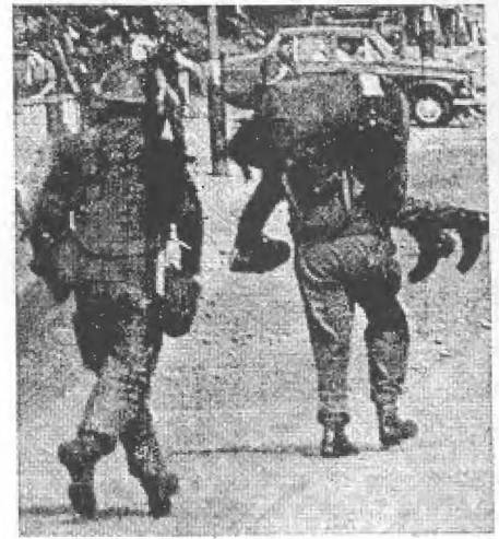
The British imperialists sent 1,300 heavily armed, "padded" and "protected" troops into the Bogside area of Derry to remove the people's barricades, but it was the British mercenary troops who were forced to scuttle to safety carrying their injured. "A just cause enjoys abundant support, while an unjust cause finds little support."