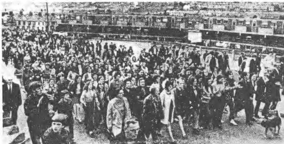
Refusing to be cowed by the brutal repression of British imperialism, women of Derry march in protest against the fascist internment policy.

(Editor's note: The Communist Party of Ireland (Marxist-Leninist) is leading the struggle of the Irish people for national liberation from British imperialism, the common enemy of the people of England, Ireland, Scotland and Wales. At a time when the broad masses of the Irish people are rising to wage powerful struggles against British imperialism and its lackeys, the CPI (M-L) alone has put forth a correct line; all other parties and groups are sinking in the mire of opportunism and sectarianism. Workers' England Weekly News salutes the unshakeable militant unity of the English working class with the Irish people by publishing the recent statement of the C.P.I. (M-L) issued on September 1st.)