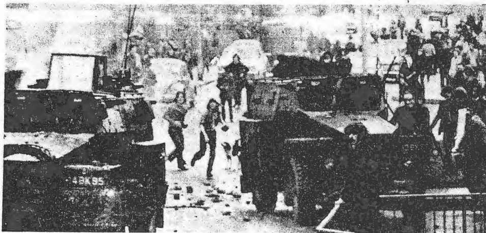
The courageous people of Derry, relying on their own strength, humiliate the heavily armoured cars of the British imperialist mercenary troops after an army lorry brazenly ran down and killed a young boy.

3) The struggle for national liberation can only be victorious if it is based on protracted warfare involving 99% of the people. The British imperialist mercenary troops will