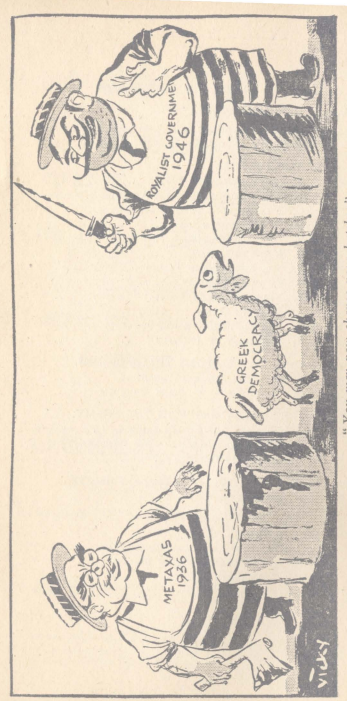
(With acknowledgments to the "News Chronicle") "You may now change your butcher"