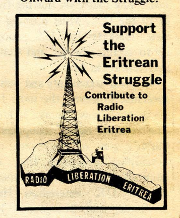
Send to: Radio Liberation Eritrea c/o UNITE! PO Box 8041 Chicago, Illinois 60680 U.S.A. Payable to Radio Liberation Eritrea