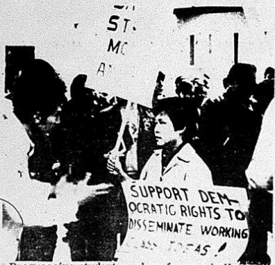
Progressive students and professors in Halifax rose to defend the right to disseminate revolutionary literature, and especially Mao Tse-tung Thought.

unions and throw the imperialist rules and regulations into the dustbin of history by developing mass democratic anti-imperialist struggles at the place of work. Revolutionary intellectuals and youth will continue denunciations of the decadent bourgeois educational system and fascist rules and regulations. National minority groups will further organise against racial discrimination and repression and against the fascist immigration department. Native