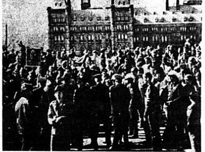
In Ottawa, April 18th, hundreds of people demonstrated against U.S. aggression in Vietnam & denounced the fascist police for attacking the progressive people. The fighting spirit shook the nation for its militancy and won the approval of the broad masses present (above).

---Our Party will continue to support the revolutionary anti-imperialist struggles of the Indo-Chinese people, Korean people, the Palestinian people and the working and oppressed peoples of Asia, Africa and Latin America against U.S. imperialism and all their running dogs. We will deepen and broaden the solidarity and support between the three North American Marxist-Leninist Parties - The Communist Party of Canada (Marxist-Leninist), the Communist Party of Quebec (Marxist-Leninist) and the American Communist Workers Movement (Marxist-Leninist) and with other fraternal parties, especially with the Communist Party of Ireland (Marxist-Leninist) and the English Communist Movement (Marxist-Leninist).