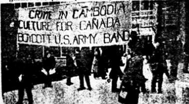
Anti-imperialist demonstrations erupted all over Canada. Here the people of Regina demonstrate against the U.S. imperialist Army band's "visit" on May 14th.

---The Party will continue to strive to unite with all those who are opposing U.S. imperialism in practice and are mobilising the people against our principal enemy through their work.