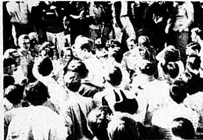
Calgary - July 4th. Mass democracies held to support the Indo-Chinese people's struggle against U.S. imperialist aggression.

---The Party will lead the THREE REVOLUTIONARY MOVEMENTS in all areas and will subordinate all other struggles to these leading struggles.