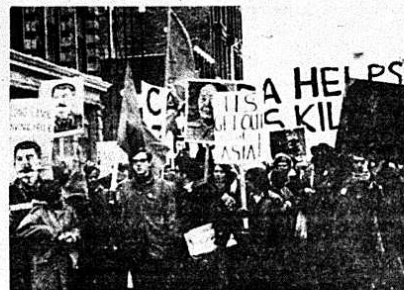
Militant demonstration against U.S. aggression in Vietnam held in Ottawa, February 28, 1970. "Escalate People's War!", "Down with U.S. imperialism!" smashed the pacifist & reformist muck of the holy alliance of the "left".

---Our Party will continue to work for developing further ties between the Canadian working class and people and the Chinese working class and people. Our Party hails the formation of diplomatic relations between the two countries and will work towards further intercourse between the two countries.