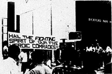
National Minority workers Union in Toronto on August 15th, denounces the racist and fascist attacks against 5 Indian patriots disseminating revolutionary literature at a local High School.

unions and throw the imperialist rules and regulations into the dustbin of history by developing mass democratic anti-imperialist struggles at the place of work. Revolutionary intellectuals and youth will continue denunciations of the decadent bourgeois educational system and fascist rules and regulations. National minority groups will further organise against racial discrimination and repression and against the fascist immigration department. Native