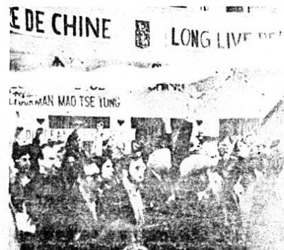
October 3rd in Montreal. Over 300 people hail the glorious 21st Anniversary of the People's Republic of China.

---Our Party will continue to support the revolutionary anti-imperialist struggles of the Indo-Chinese people, Korean people, the Palestinian people and the working and oppressed peoples of Asia, Africa and Latin America against U.S. imperialism and all their running dogs. We will deepen and broaden the solidarity and support between the three North American Marxist-Leninist Parties - The Communist Party of Canada (Marxist-Leninist), the Communist Party of Quebec (Marxist-Leninist) and the American Communist Workers Movement (Marxist-Leninist) and with other fraternal parties, especially with the Communist Party of Ireland (Marxist-Leninist) and the English Communist Movement (Marxist-Leninist).