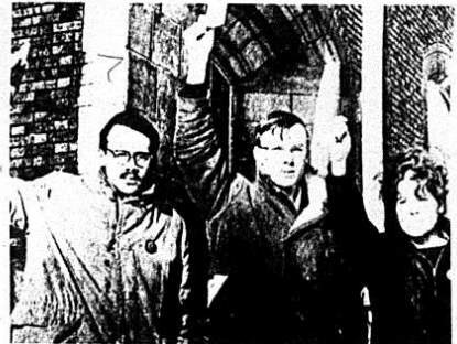
In February, 1970, the birth of the first Mao Tseung Thought Propaganda Team marked the spirit and enthusiasm which also greeted the formation of the Communist Party of Canada (Marxist-Leninist) on March 31st.

Comrades and friends: With these programmes in mind we welcome the second year of the great 1970's! With such optimism in the 1970's, the decade of liberation, with such faith in the developing world anti-imperialist revolution, led by our great and glorious leader Chairman Mao, and with such revolutionary resolve which our comrades have shown during the first year, who can say that the Canadian working class and people do not have high hopes and complete faith in victory! The sky is the limit! We want nothing less than having our destiny in our own hands - nothing less than complete independence and freedom from the yoke of U.S. imperialism.