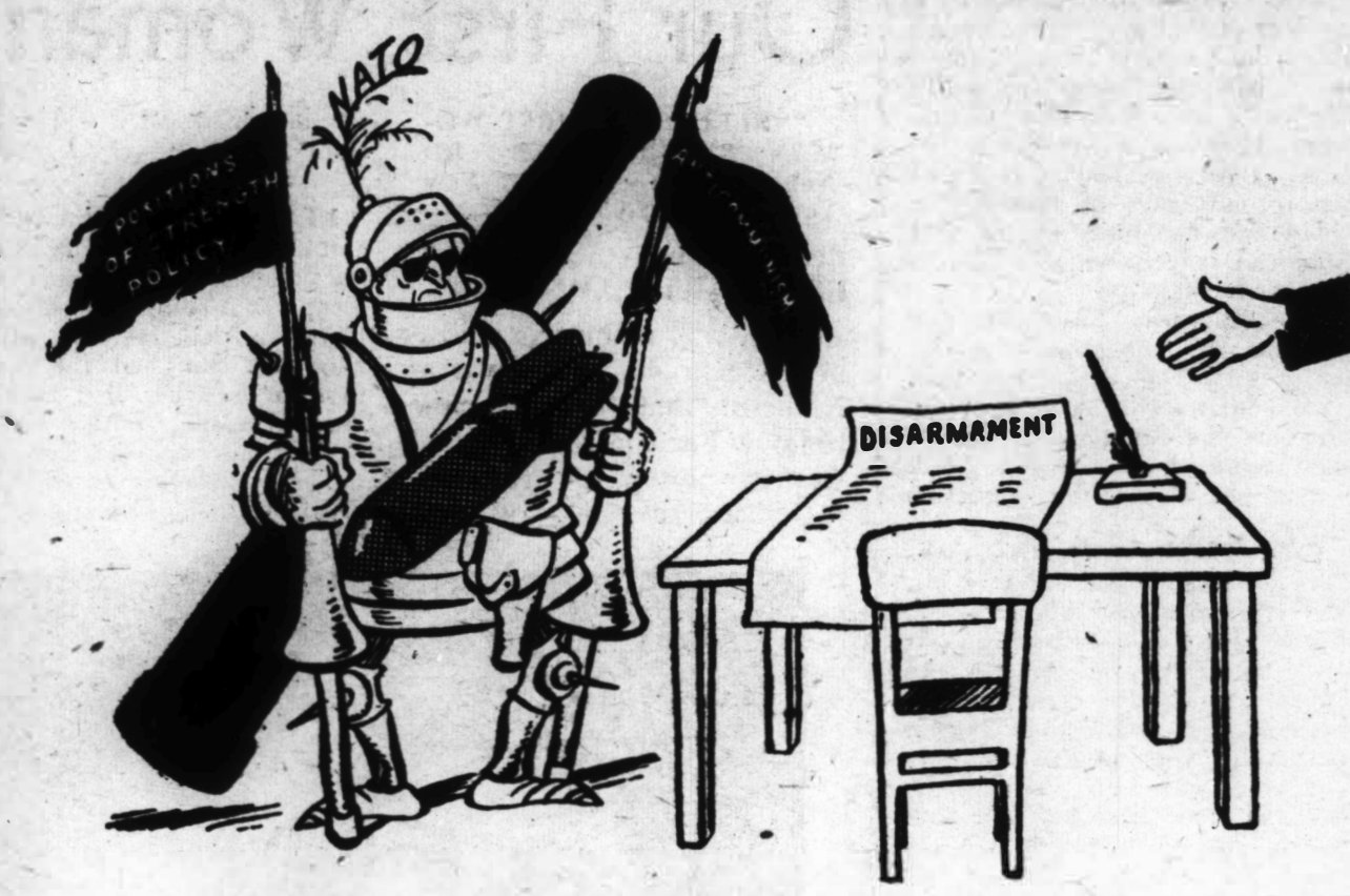
Can't sign. I have my hands full.

the eyes of the membership and the masses; that the party leadership, as constituted today, is either incapable or unwilling to make the necessary changes required to move our party out of its isolation; and that our party has no future on the American scene.