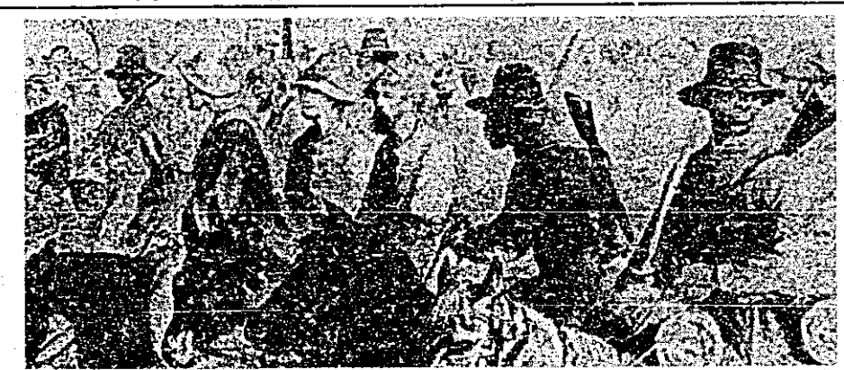
Black Union cavalrymen bring in Confederate prisoners during Civil War.

What American Civilization on Trial reveals is both Marx's deep American roots and his Promethean vision. Marx's deep American roots and his Promethean vision. Take the succinct way in which Marx pinpointed the situation in the Civil War at its darkest moment, as the war dragged on and the Southern generals were winning so decisively as to produce a defeatist attitude in the North. Where others looked at the military forces, Marx looked at the forces of revolution: "A single Negro regiment would have a remarkable effect on Southern nerves ... a war of this kind must be conducted along revolutionary lines ...." (Letter from Marx to Engels, August 7, 1862). From his very first break with capitalism, as he discovered a whole new continent of thought and of revolu-