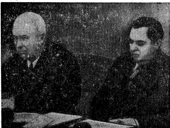
Former Soviet Premier Malenkov (right), who was deposed by Party boss Khrushchev (left), is now in Budapest directing the puppet Kadar government. According to a Nov. 28 Associated Press dispatch, Malenkov is responsible for Kadar's recent switch from promises to renewed threats of reprisals against the striking Hungarian workers.