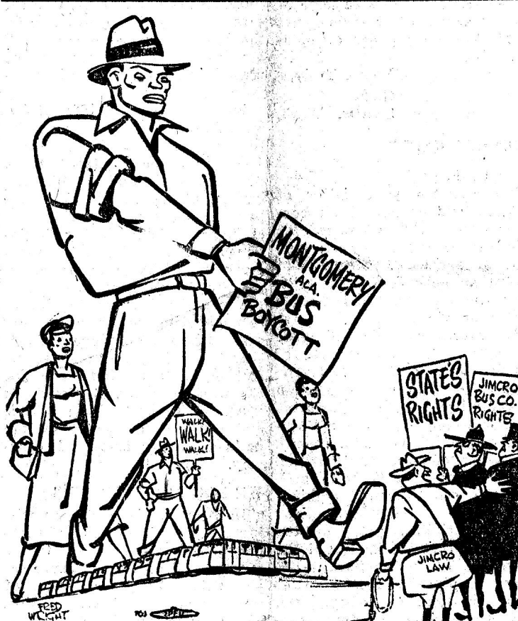
This cartoon which appeared in the labor press last April captures the spirit of militant solidarity that has prevailed in the bus protest movement in both Montgomery and Tallahassee, Fla. See page 4 for interviews with the Tallahassee freedom fighters.