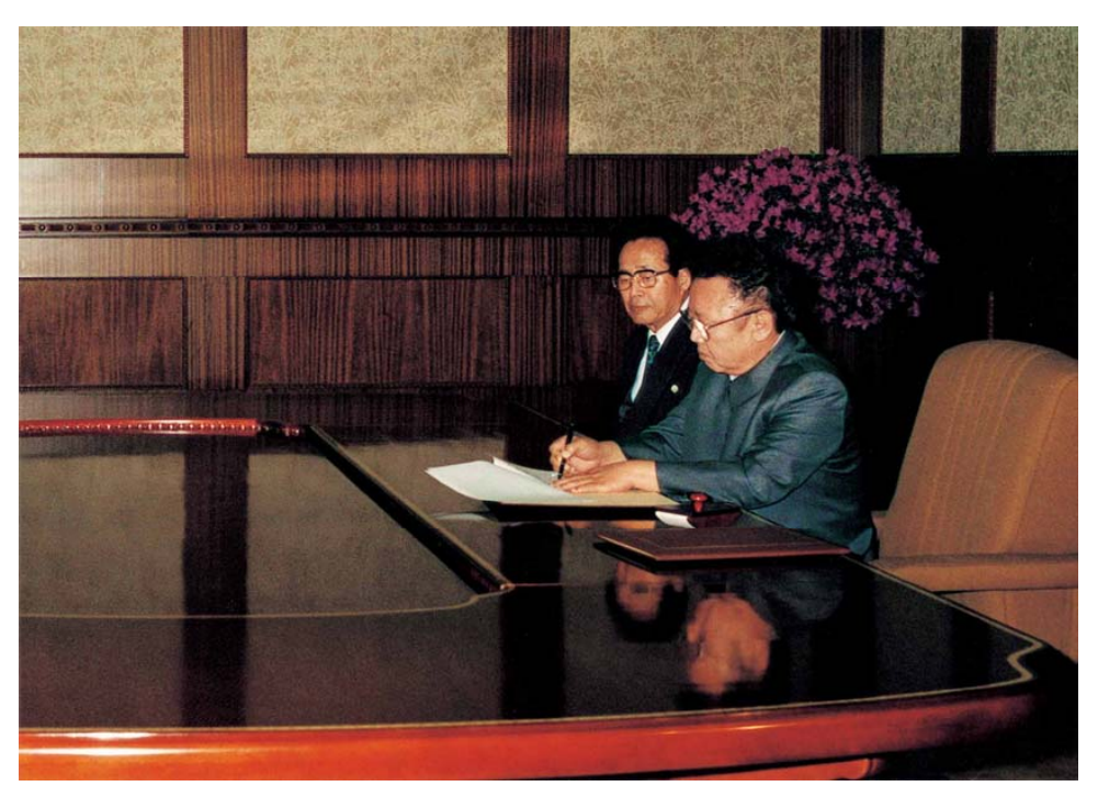
Kim Jong II signing the historic North-South Joint Declaration