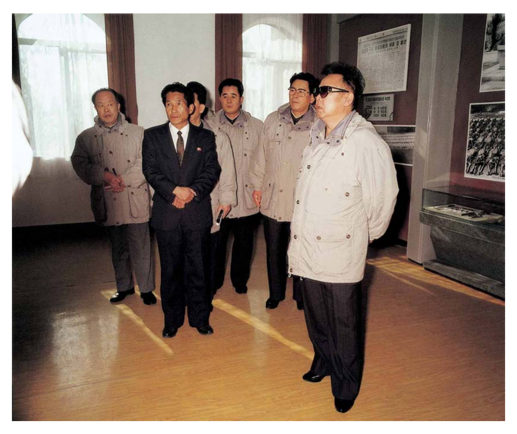
Kim Jong II looking round the Sinchon Museum