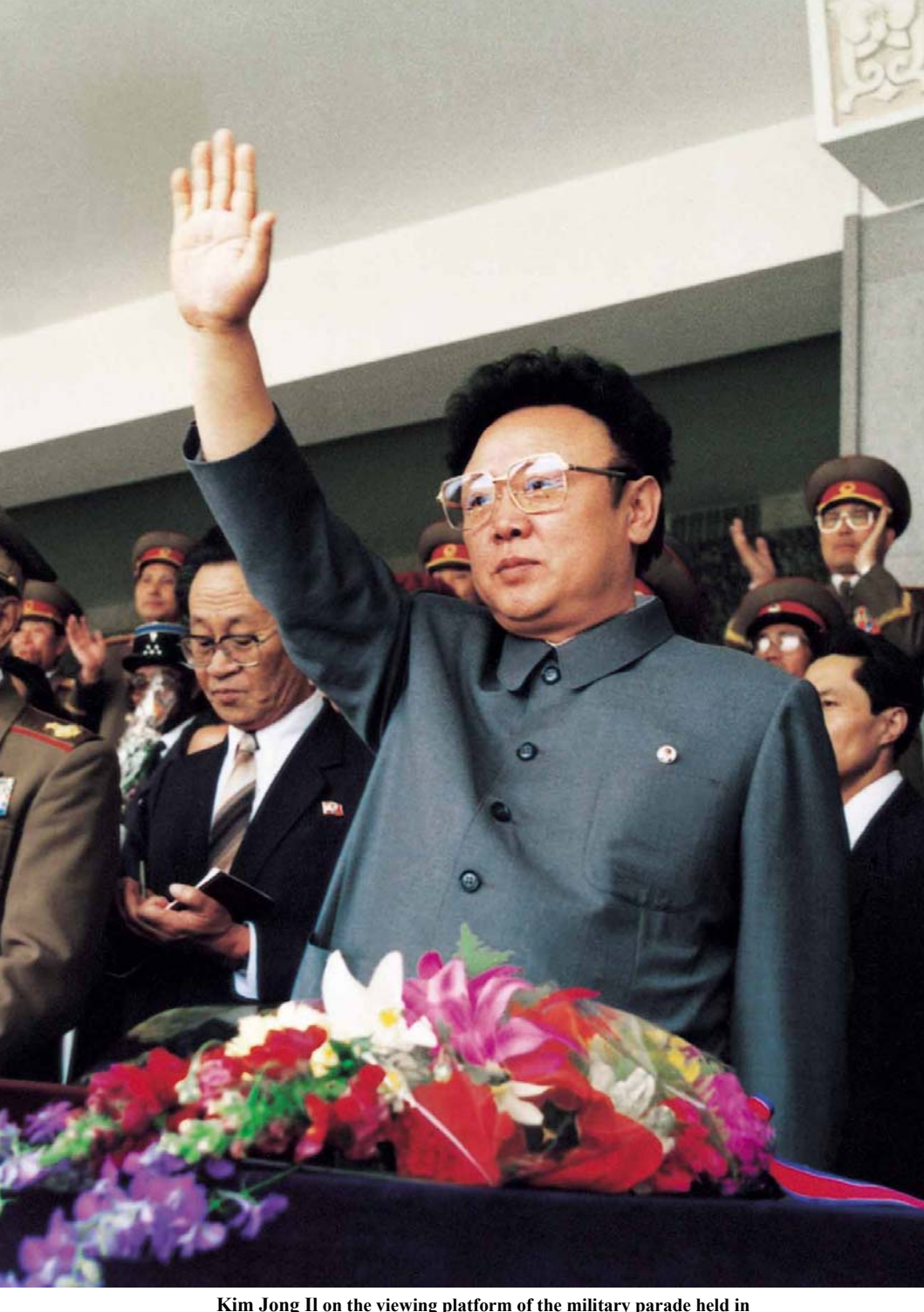
Kim Jong II on the viewing platform of the military parade held in celebration of the 60^{\rm th} anniversary of the Korean People's Army