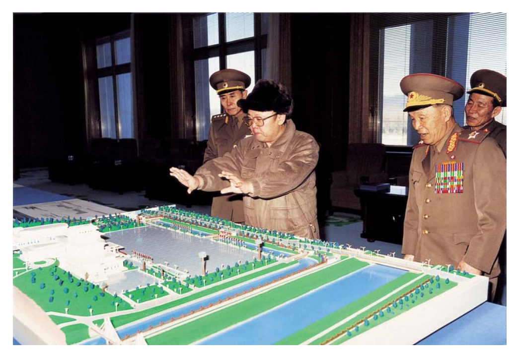
Kim Jong II inspecting a sand model of the Kumsusan Memorial Palace