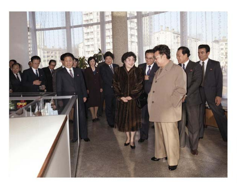
At the Kyonghung Shop (February 1988)