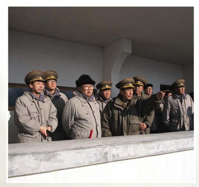
At the Seoul Ryu Kyong Su Guards 105<sup>th</sup> Tank Division (December 1996)