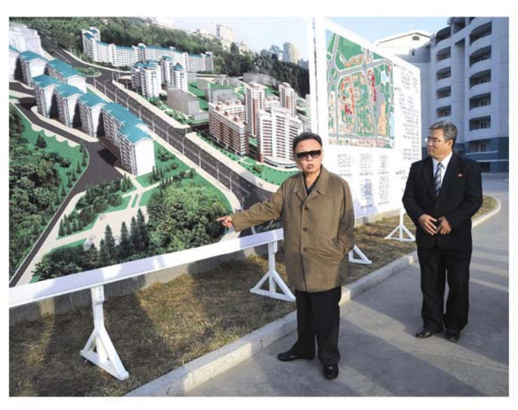
In the newly-built Mansudae Street (October 2009)