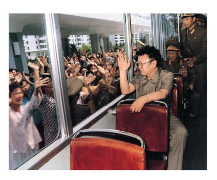
Waving back to the cheering people (July 1995)