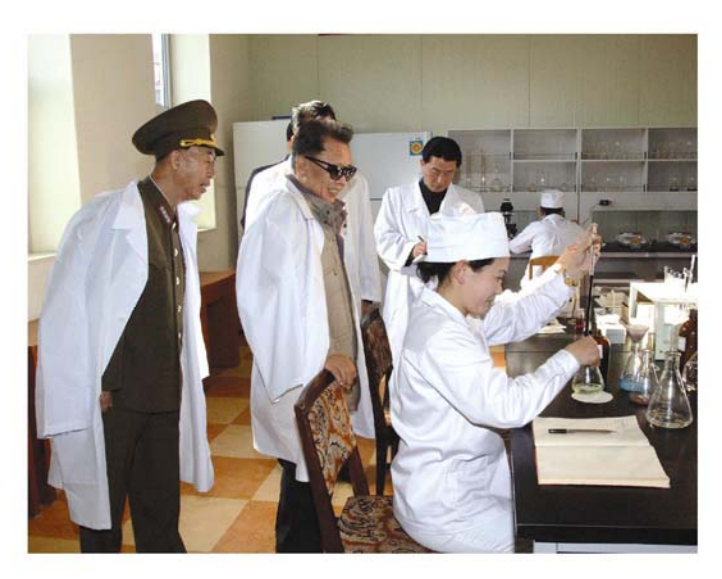
At the Samilpho Specialities Factory (April 2009)